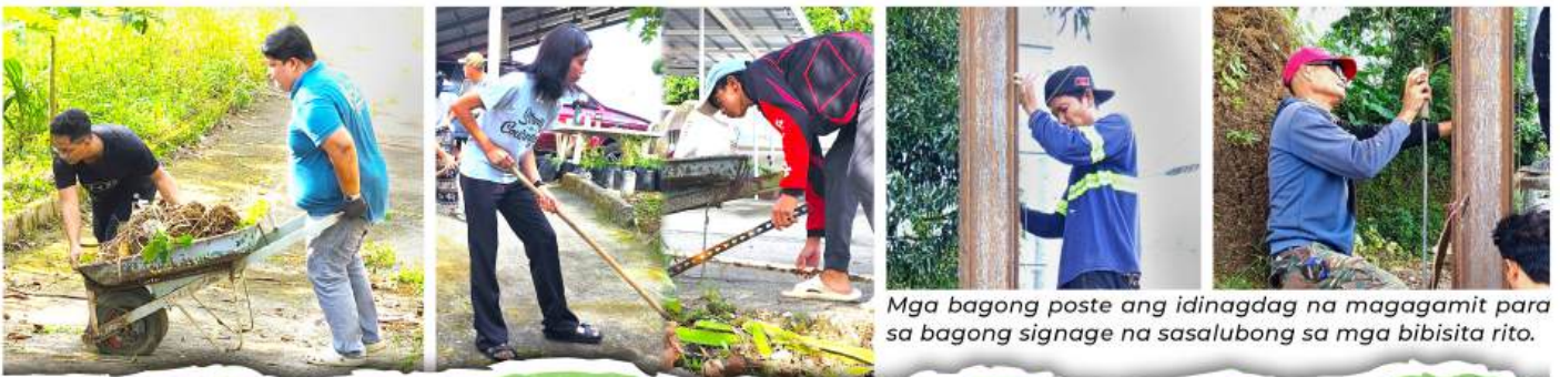
Mga bagong poste ang idinagdag na magagamit para sa bagong signage na sasalubong sa mga bibisita rito.

12 But as many as received Him, to them He gave the right to become children of God, to those who believe in His name: 13 who were born, not of blood, nor of the will of the flesh, nor of the will of man, but of God.