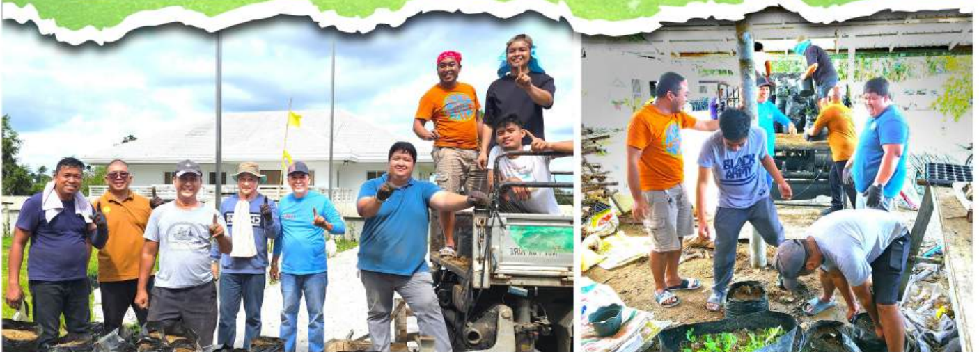
May kaakibat man na kapaguran sa paghahanda ngunit ang kagalakan habang gumagawa ang nangingibabaw sa bawat isa. Mula sa pagtutulungan, nagbubunga ito ng malaking resulta para sa kapakinabangan ng ministeryo ng Diyos.

Simula pa lamang ng taon ay masisilayan na ang masaganang ministeryo ng UCF Mt. Tabor na kapupunan ng iba't ibang gawain na layuning magbukas ng pagkakataong maihayag si Kristo sa mga nawawalang tupa.