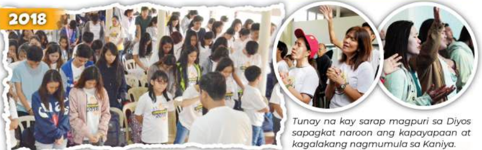
Tunay na kay sarap magpuri sa Diyos sapagkat naroon ang kapayapaan at kagalakang nagmumula sa Kaniya.