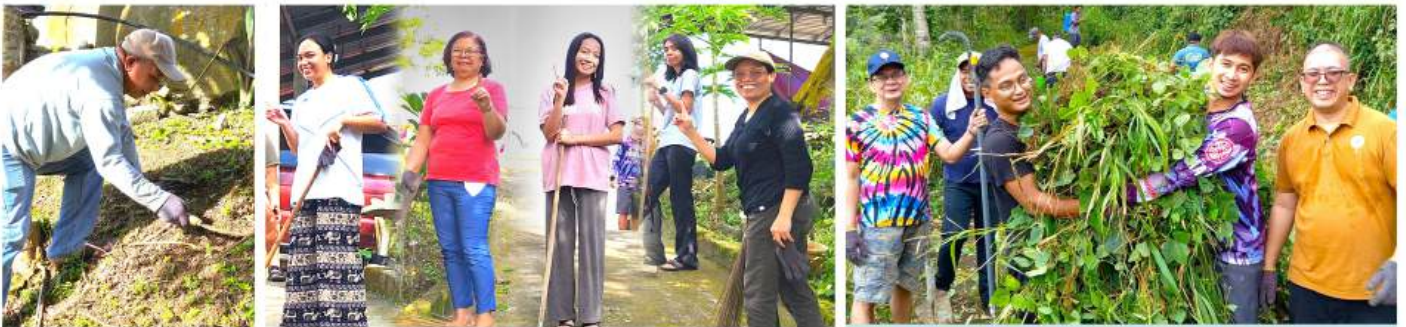
Isang kaluguran ang kakaiba sa mga munting gawain katulad nito dahil ang Diyos ang nakakakita sa kanilang mga puso na nais makapaglingkod para sa Kaniyang karangalan.