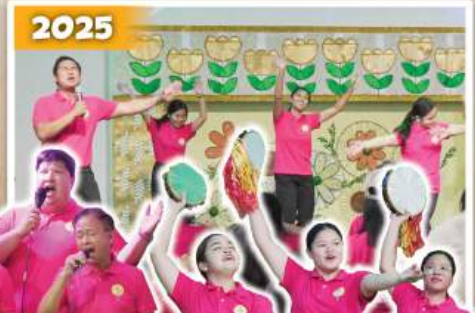
Papuri at pasasalamat ang lamanin ng mga puso ng anak ng Diyos sapagkat ang Diyos ay mabuti at tapat.