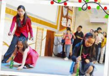
Napuno ng tawanan ang lugar dahil sa mga nakatutuwang palaro. Masiglang lumahok ang kabataan at maging ang mga nanay at tatay ng panambahan.