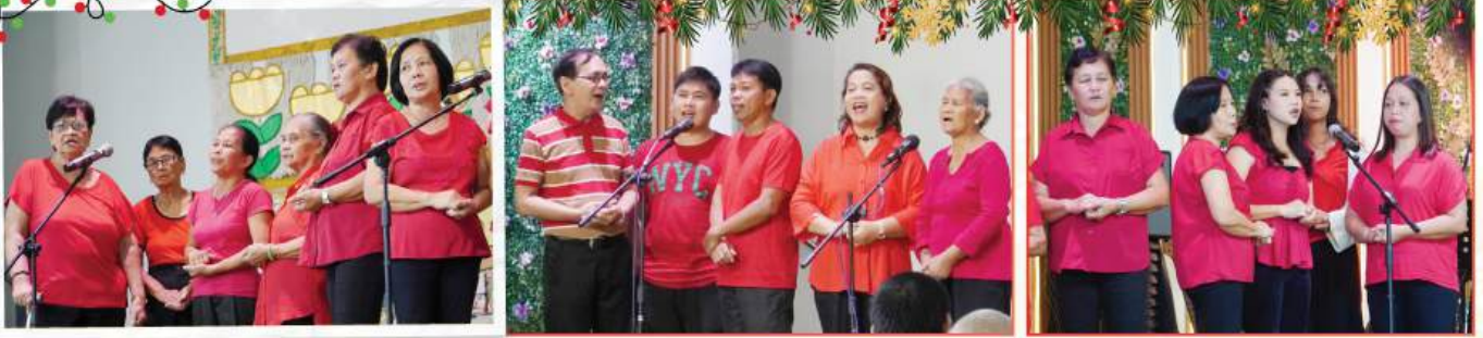
Ang bawat kaluluwang idinako ng Diyos sa panambahan ng UCF ay patotoo ng mabuting plano ng Diyos para sa Kaniyang mga anak.

Handog din ng mga miyembro ng mga Home Bible Church (HBC) ang mga espesyal na awiting naglalahad sa kapanganakan ni Hesu Kristo.