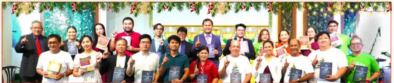
Ang mga pastor, boluntaryo, at aktibong miyembro, at lider ng mga HBC ay nakatanggap din ng mga Bibliya at mga kuwaderno na tunay na magiging kagamit-gamit para sa kanilang pag-aaral ng Salita ng Diyos.