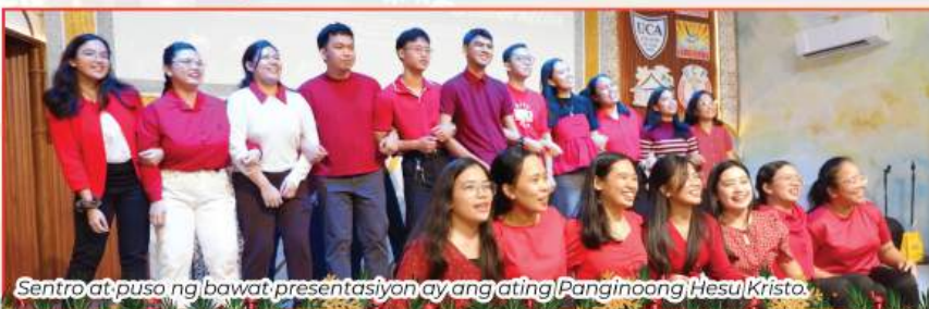
Sentro at puso ng bawat presentasyon ay ang ating Panginoong Hesu Kristo.