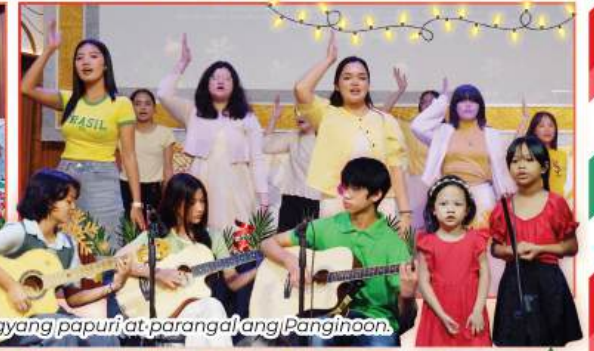
Kagalakan sa puso ng bawat isa ang mabigyang papuri at parangal ang Panginoon.