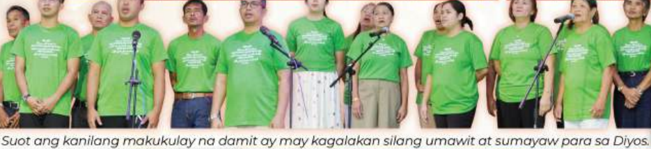
Suot ang kanilang makukulay na damit ay may kagalakan silang umawit at sumayaw para sa Diyos.