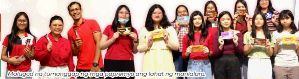
Malugod na tumanggap ng mga papremyo ang lahat ng manlalaro.