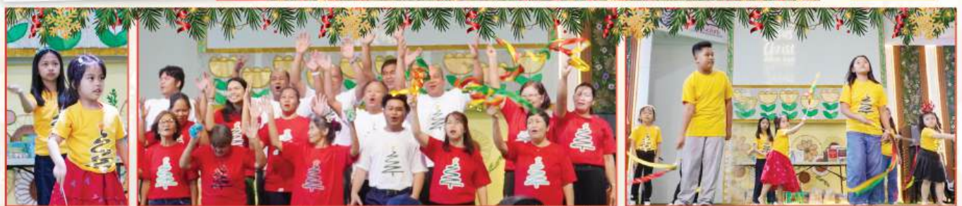
Mapa-bata man o matanda ay nakibahagi ang lahat sa mga gawaing nagtatanghal sa Diyos.