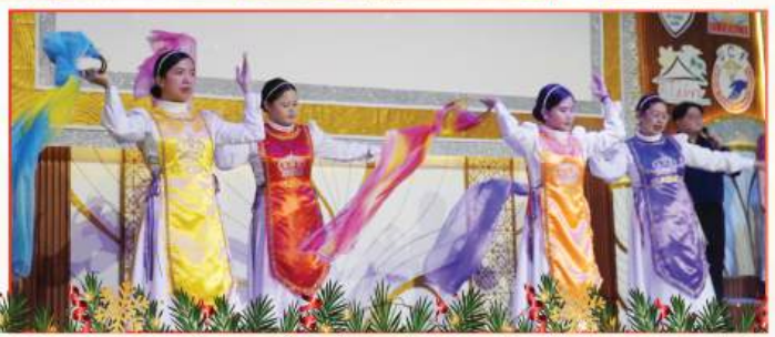
Tunay na mayroong kagalakan at kapayapaan sa presensiya ng Diyos. Ang lahat ng mga kaluluwang tunay na naghahanap sa Panginoon ay kasumpungin Niya ayon sa Kaniyang kalooban.