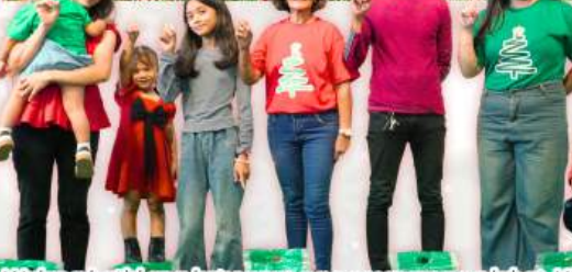
Walang batid ang katuwaan ng pagsasama ng lahat. Hindi lang pagkain ang kanilang pinagsaluhan kung hindi mayroon din silang natanggap na mga t-shirt, sombrero, at iba pang mga munting regalo na ikinasaya ng bawat isa.