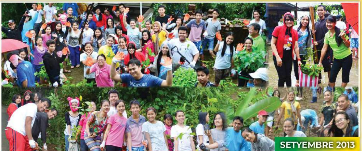
Sama-sama ang buong pamilya ng UCF para sa pangalawang Tree Planting Program noong 2013.