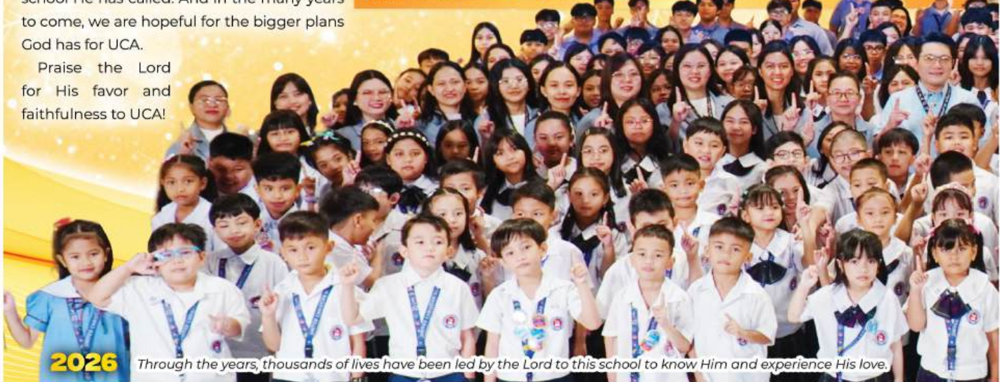
Through the years, thousands of lives have been led by the Lord to this school to know Him and experience His love.