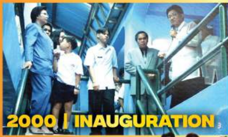
2000 | INAUGURATION