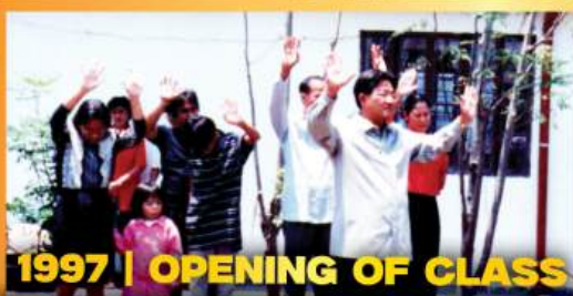
1997 | OPENING OF CLASS

Praise the Lord for His favor and faithfulness to UCA!