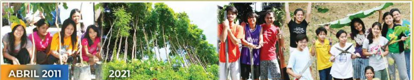
Unang isinagawa ang Tree Planting Program sa Mt. Tabor noong taong 2011. Tinamnan ng mga mahogany tree ang iba't ibang bahagi ng kalsada ng lugar. Ngayon, kapansin-pansin na ang paglago ng mga punong ito na mas nagpaganda rin sa kapaligiran.