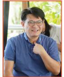
Maging ang mga teknikal na aspeto pagdating sa pag-awit tulad ng tono at tinig ay ipinaliwanag sa mga nais umawit sa Diyos.