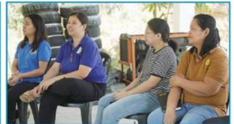
Ang mga pastor ay naglalaan din ng panahon sa pagtuturo ng Salita ng Diyos at pagbibigay ng makabuluhang mensaheng upang ang mga nais maglingkod sa Panginoon ay makasunod sa kalooban Niya sa kanilang buhay.