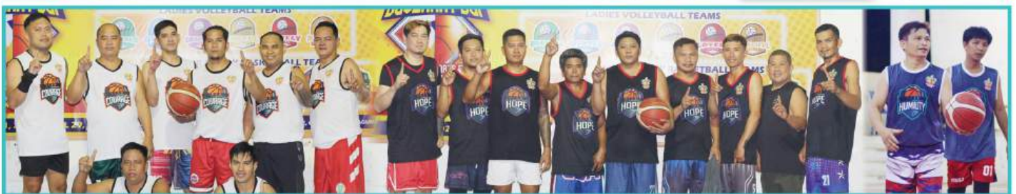
Hindi naman nagpahuli ang mga ama sa larong basketball. Higit sa kompetisyon, nahubog ang pagkakaisa at kooperasyon nila sa grupo.