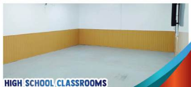
HIGH SCHOOL CLASSROOMS

The renovation of UCA classrooms is a testament to God's goodness and faithfulness in His work.