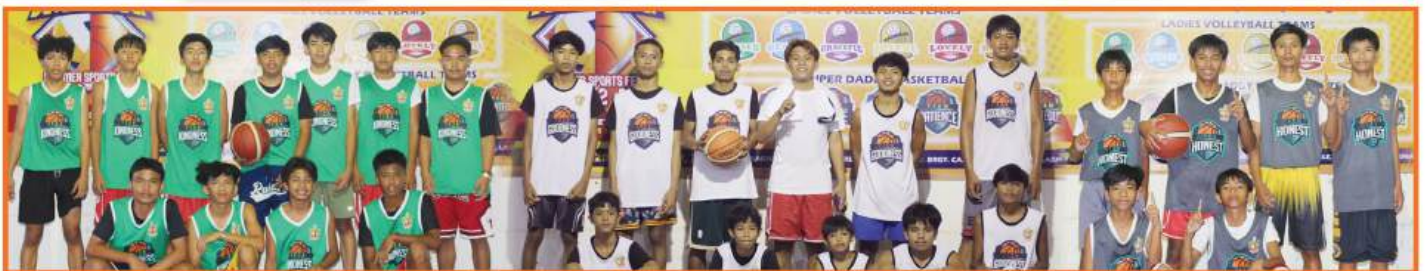
Naglaro at nakipagtagisan nang buong husay ang bawat isa. Bata man sa edad ay kanilang ipinamalas ang kanilang liksi at galing sa mga laro.