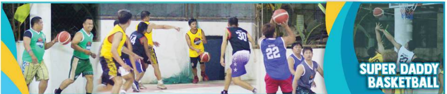
SUPER DADDY BASKETBALL