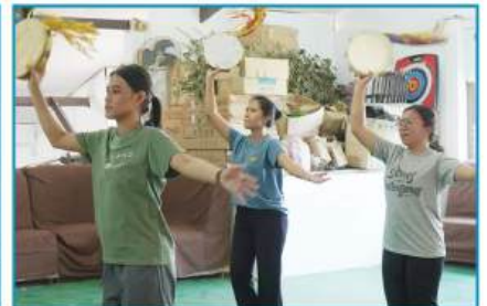
Gamit ang tambourine ay buong husay silang nag-ensayo ng iba't ibang steps at patterns sa pagsayaw para sa kaluwalhatian ng Diyos.