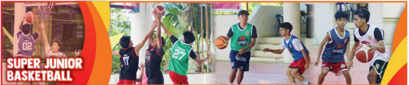
SUPER JUNIOR BASKETBALL

Purihin ang Panginoon sa kalakasan at paggabay Niya sa bawat isa upang maging matagumpay ang UCF Covenant Cup 2026!