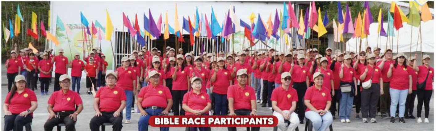
BIBLE RACE PARTICIPANTS