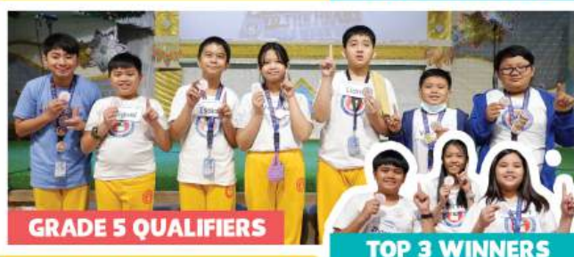
GRADE 5 QUALIFIERS