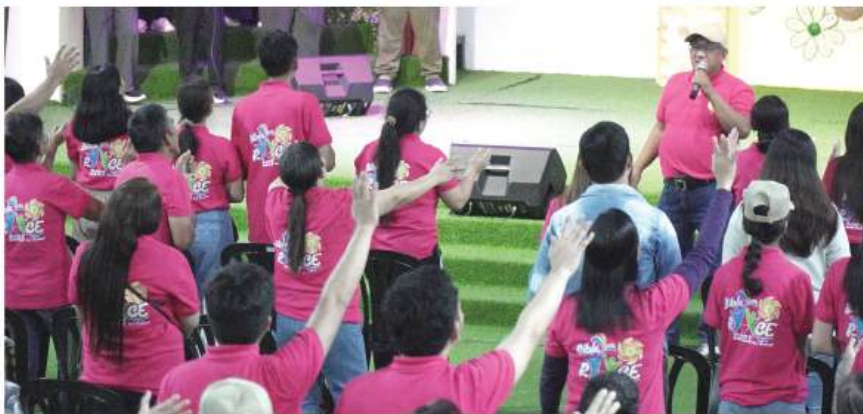
Sa pagtaas ng mga kamay, ang bawat isa ay nagpapahayag ng pagsuko ng buhay sa Diyos at paghahari Niya sa kanilang mga buhay.

During praise and worship ay napakinggan ko rin ang mga pinagdaanan ni pastor. Binigyan siya ni Lord ng buhay ulit at ng pag-asa. Ganoon din po ang naramdaman ko, na binigyan ako ng pag-asa ng Lord. Ngayon ay mas nagtitiwala ako sa Panginoon na Siya ang ating pag-asa.