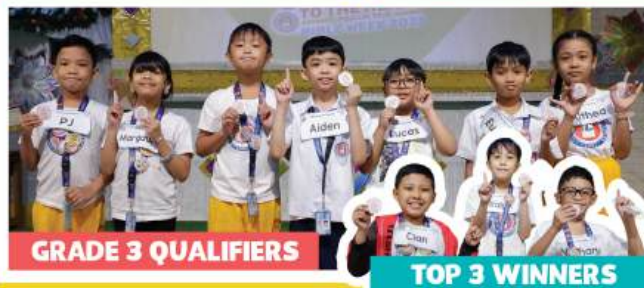
GRADE 3 QUALIFIERS