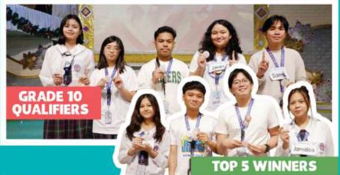
GRADE 10 QUALIFIERS