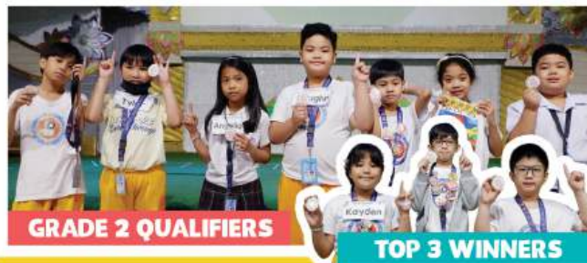
GRADE 2 QUALIFIERS