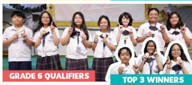
GRADE 6 QUALIFIERS