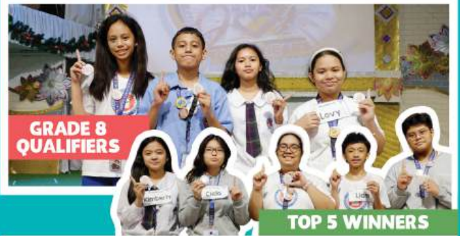
GRADE 8 QUALIFIERS