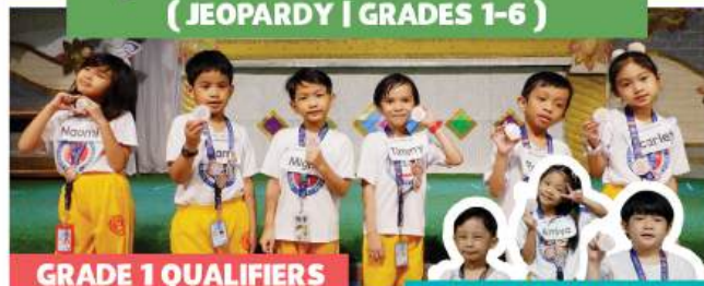
GRADE 1 QUALIFIERS