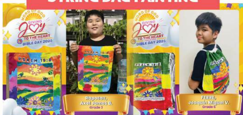
Not even the physical distance can stop the pupils from learning and participating in the contests with much enthusiasm.