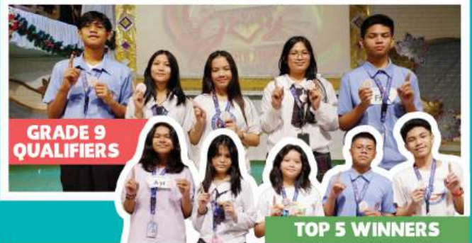
GRADE 9 QUALIFIERS