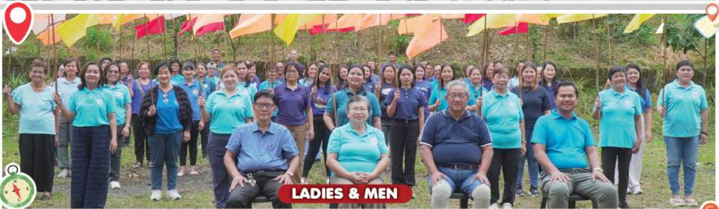
LADIES & MEN