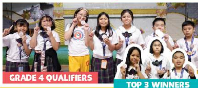
GRADE 4 QUALIFIERS