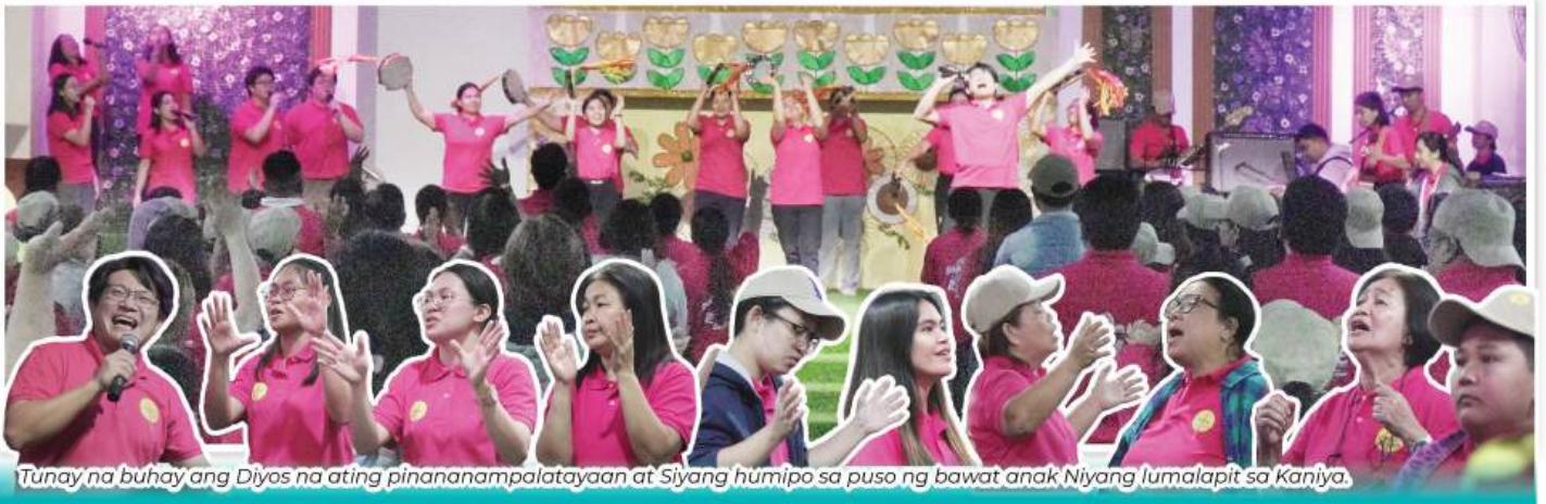
Tunay na buhay ang Diyos na ating pinananampalatayaan at Siyang humipo sa puso ng bawat anak Niyang lumalapit sa Kaniya.