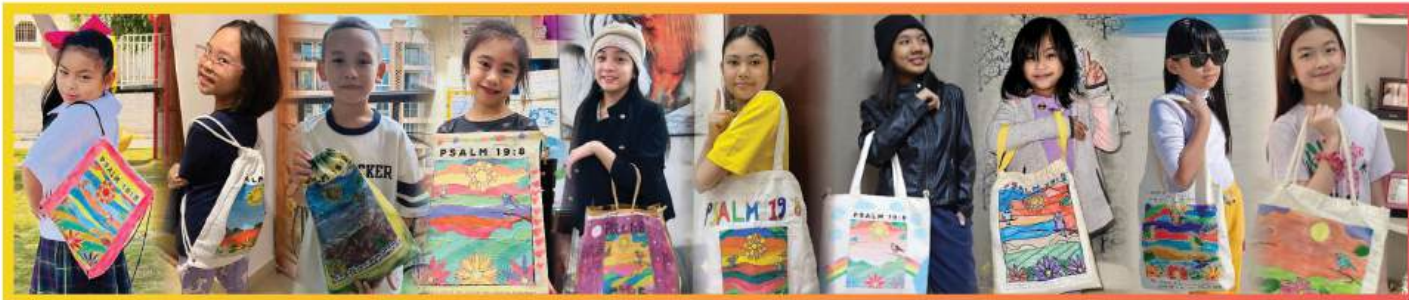
Smiling proudly, the pupils pose for a photo while holding up their vibrant string bag paintings, showcasing their ingenuity and hard work.