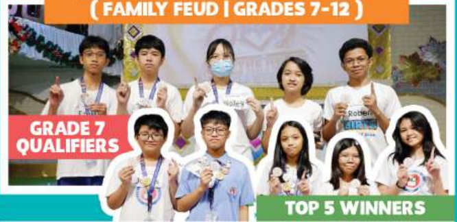
GRADE 7 QUALIFIERS