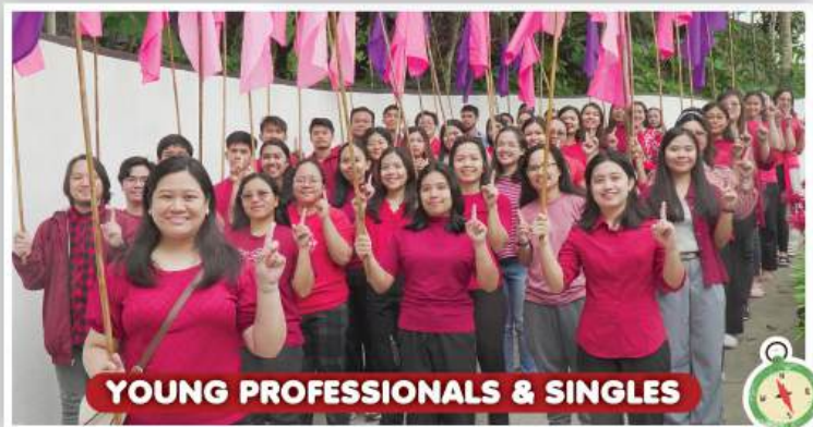
YOUNG PROFESSIONALS & SINGLES

"But you shall receive power when the Holy Spirit has come upon you; and you shall be witnesses to Me in Jerusalem, and in all Judea and Samaria, and to the end of the earth."