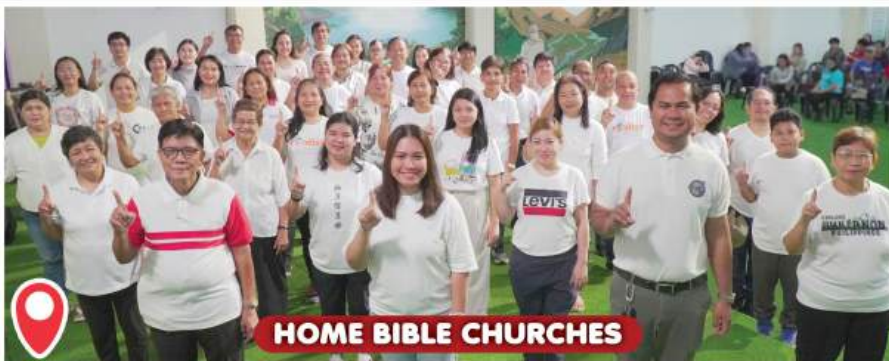
HOME BIBLE CHURCHES