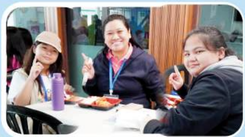
Not only are their stomachs full, but more so, their hearts overflow with joy as they bond with their fellow students and teachers.

Therefore, just as through one man sin entered the world, and death through sin, and thus death spread to all men, because all sinned. Romans 5:12 (NKJV)