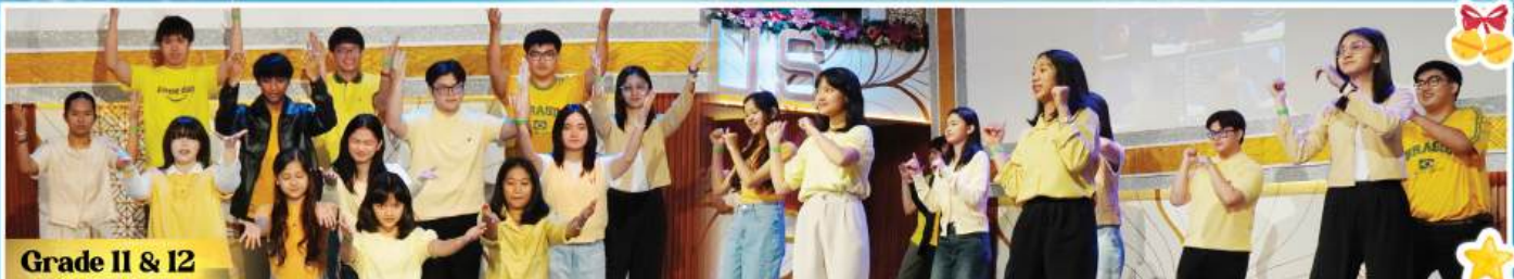
Grade 11 & 12

The simple songs become special offerings of thanks to the faithful God who gives meaning to Christmas.