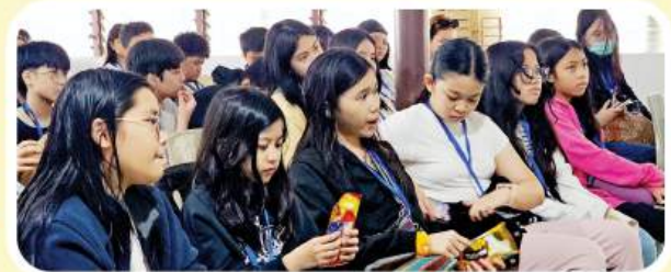
The students attentively listen to the sessions, while also taking notes which they can look back to as their guide in living a life in Christ.