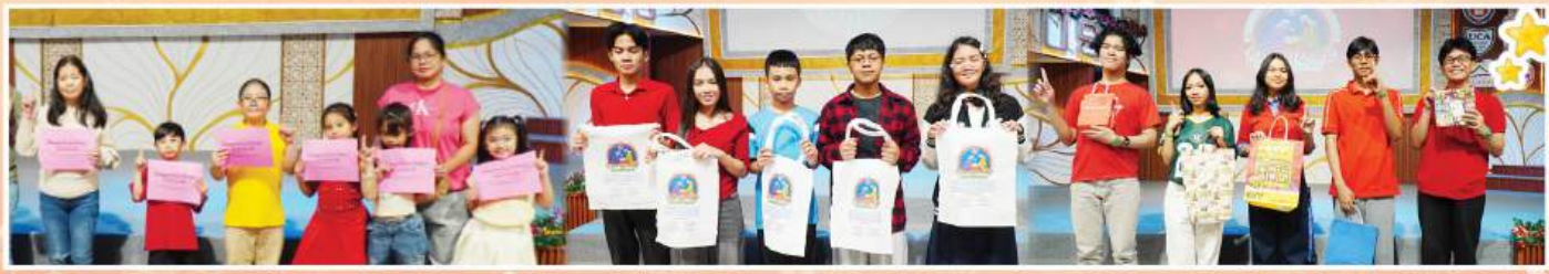
Students and parents take home various UCA merchandise like pouches, bags, mouse pads, and shirts. Students also received gifts from their classmates.

1 John 3:9 (NASB) Whoever has been born of God does not sin, for His seed remains in him; and he cannot sin, because he has been born of God.