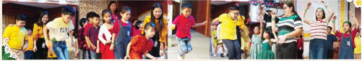
Laughter fills the stage as students participate in exciting games together with their classmates and parents, giving their best while enjoying their time.