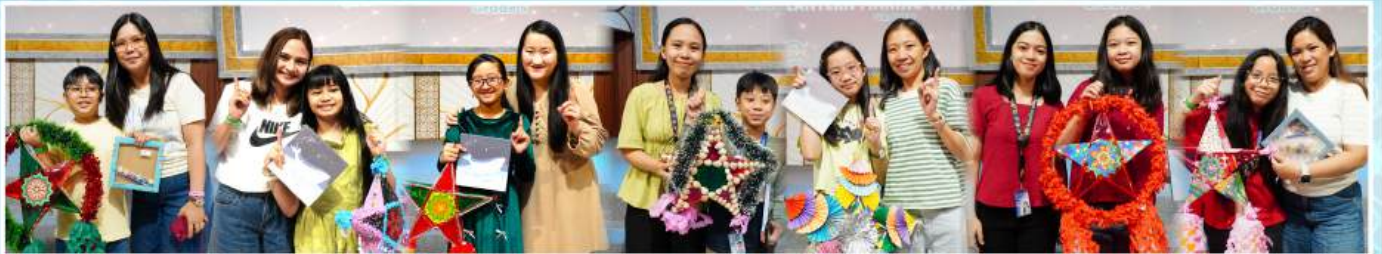
The smiles on their faces reflect their joy and happiness as they display their parols as part of the Christmas celebration in UCA.