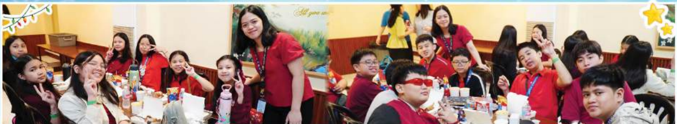
In a short period of time, students got to spend quality time with their loved ones. Indeed, it was a blessed day of spending Christmas with the UCA family.