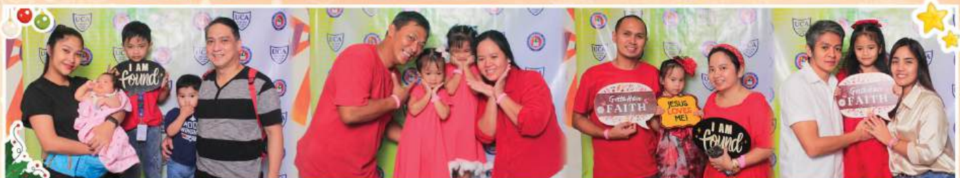
As a family, this kind of celebration is one way of enjoying their time together amidst their busy schedules.