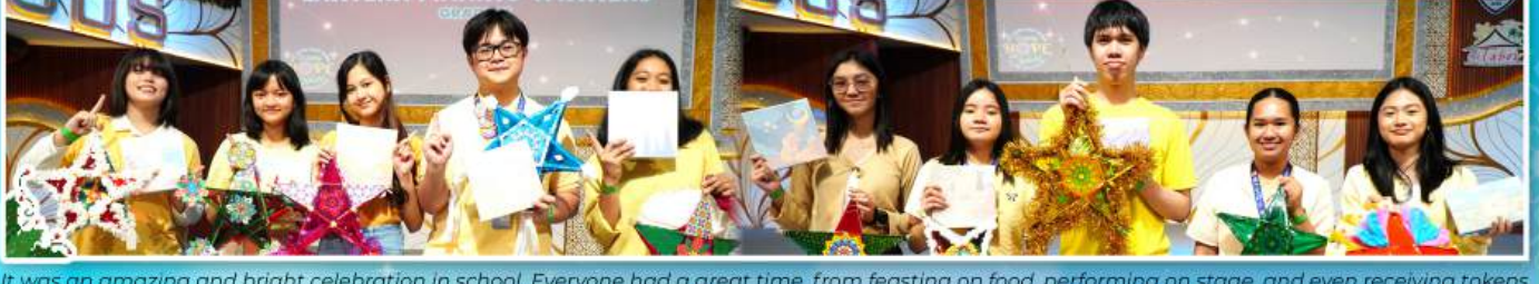
It was an amazing and bright celebration in school. Everyone had a great time, from feasting on food, performing on stage, and even receiving tokens and raffle prizes.

My Father, who has given them to Me, is greater than all; and no one is able to snatch them out of My Father's hand.