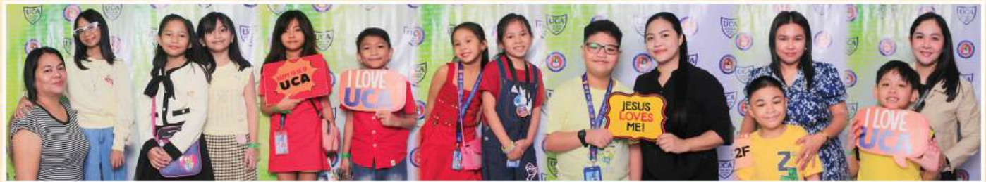
Friends, who also became their family in UCA, take the opportunity to have their photos together, showing the strong bond and good relationship they have built throughout the year.