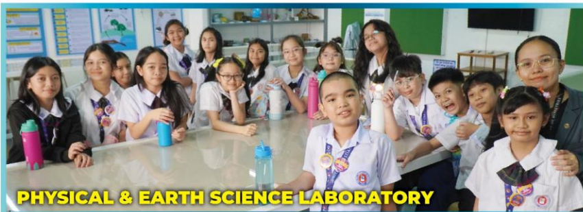
PHYSICAL & EARTH SCIENCE LABORATORY