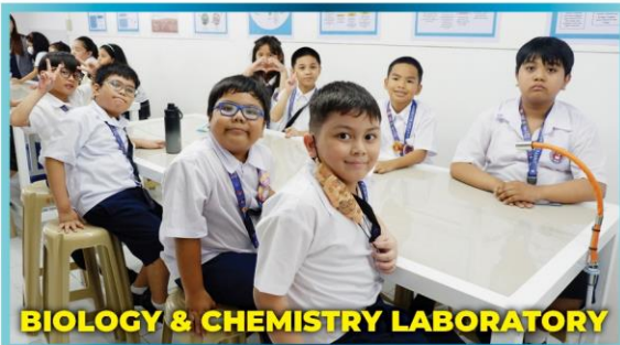
BIOLOGY & CHEMISTRY LABORATORY

Joyful smiles and exciting laughs fill each laboratory that is visited by the students.