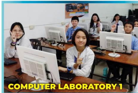
COMPUTER LABORATORY 1