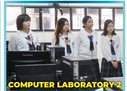
COMPUTER LABORATORY 2