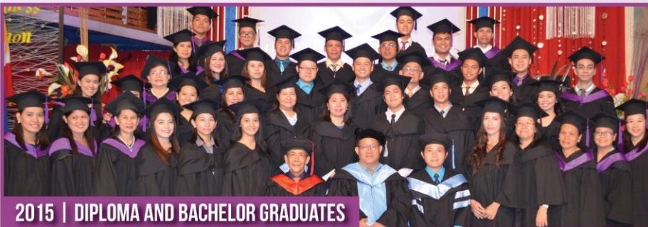
2015 | DIPLOMA AND BACHELOR GRADUATES