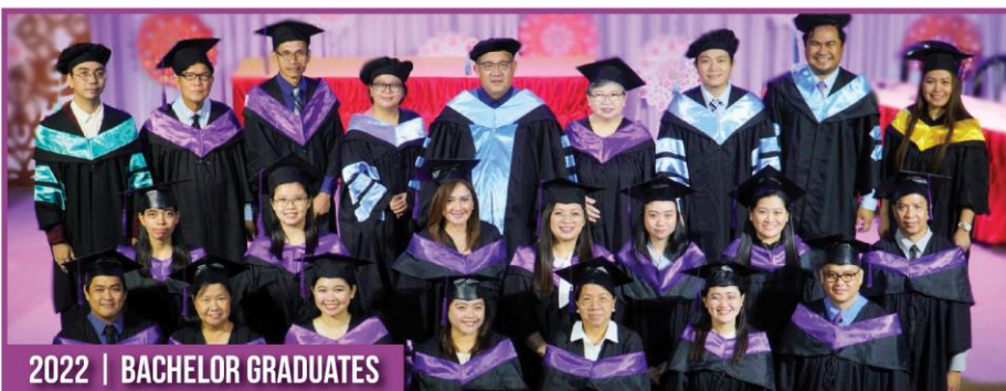
2022 | BACHELOR GRADUATES