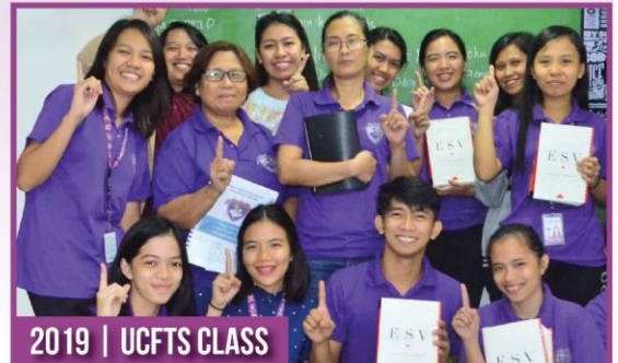
2019 | UCFTS CLASS

It was 2009 when the Bible school was officially named as UCF Theological Seminary. As the church grew in number, more children of God desired to be equipped as workers for the ministries of God.