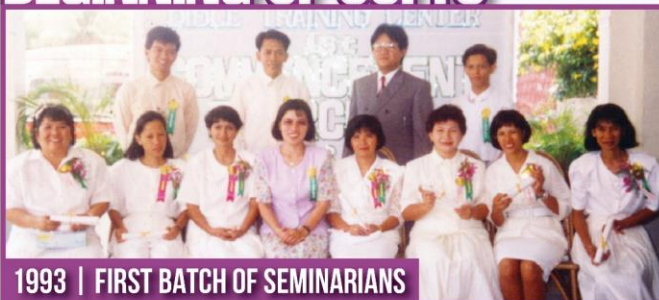
1993 | FIRST BATCH OF SEMINARIANS