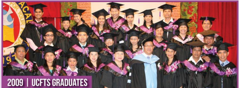
2009 | UCFTS GRADUATES