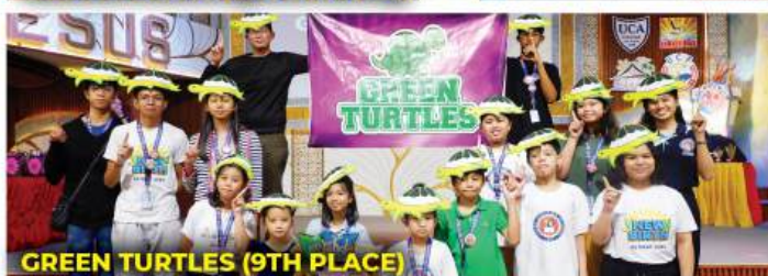
GREEN TURTLES (9TH PLACE)