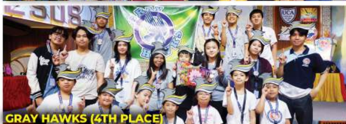
GRAY HAWKS (4TH PLACE)