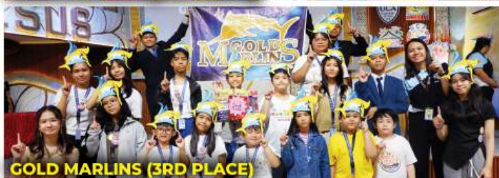
GOLD MARLINS (3RD PLACE)