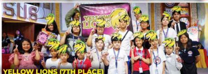
YELLOW LIONS (7TH PLACE)