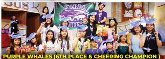
PURPLE WHALES (6TH PLACE & CHEERING CHAMPION)