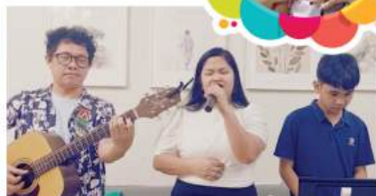
ABUCAYON FAMILY 1 st Runner Up