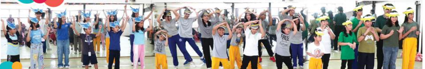
Wearing the color of their respective teams, the students gave their utmost support to their team by giving their best in the cheering.

And Jesus said to them, "I am the bread of life. He who comes to Me shall never hunger, and he who believes in Me shall never thirst.