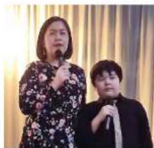
RAPOSAS FAMILY Champion