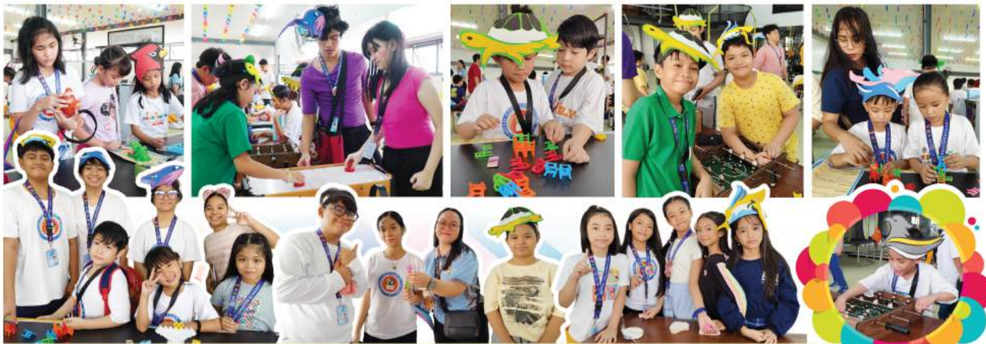
Truly, the booth games is not only for the enjoyment of the students, but it is also an opportunity for them to make new friends.

Exciting prizes awaits those who actively participated in the booth games. Games like Tetra Tower, Balance Chairs, Crocodile Dentist, hockey, and even board games made this celebration more exciting as they are challenged to win every game to redeem their desired prizes.