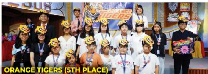
ORANGE TIGERS (5TH PLACE)