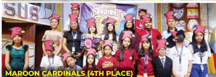
MAROON CARDINALS (4TH PLACE)