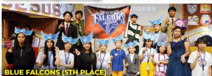
BLUE FALCONS (5TH PLACE)