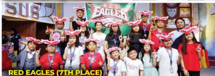
RED EAGLES (7TH PLACE)