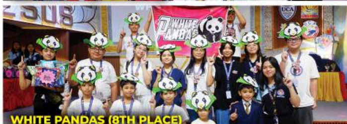
WHITE PANDAS (8TH PLACE)