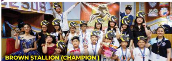
BROWN STALLION (CHAMPION)