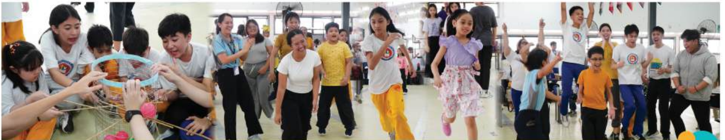
The students beam with joy as they get closer and closer in becoming this year's fun games champion.

Team members worked hand-in-hand as they play in the fun games! Through this, the students developed teamwork, established rapport, and built camaraderie within their team that helped them win in the games. Most importantly, it is another memorable experience for them and their classmates.