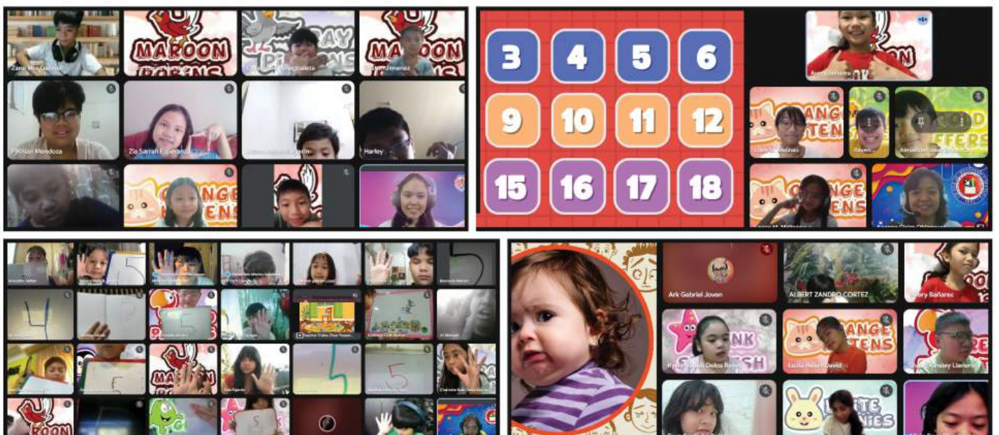
Despite conducting the booth games online, the excitement and joy is evident in the faces and smiles of the students.

Students from the Junior and Senior League also take part in the online booth games via Google Meet. Various games like Give Me 5, Rock-Paper-Scissors, Spot the Difference, Mimicry, Emoji Guess, and i-Spy tested their wits and quick thinking skills while collecting as many winning tickets as they can in each game.