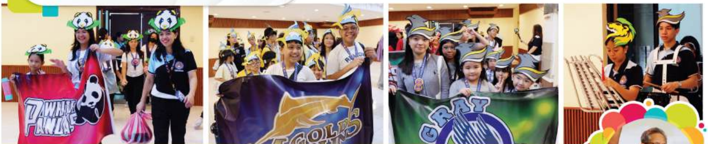
Each team enters the auditorium wearing their colorful headdresses and banners that represent their teams.

To officially begin the week-long celebration of the 29 th Foundation Week, teams gathered at the auditorium for the opening ceremony. This stirred up excitement and anticipation for what is to come in this event.