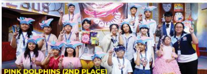
PINK DOLPHINS (2ND PLACE)