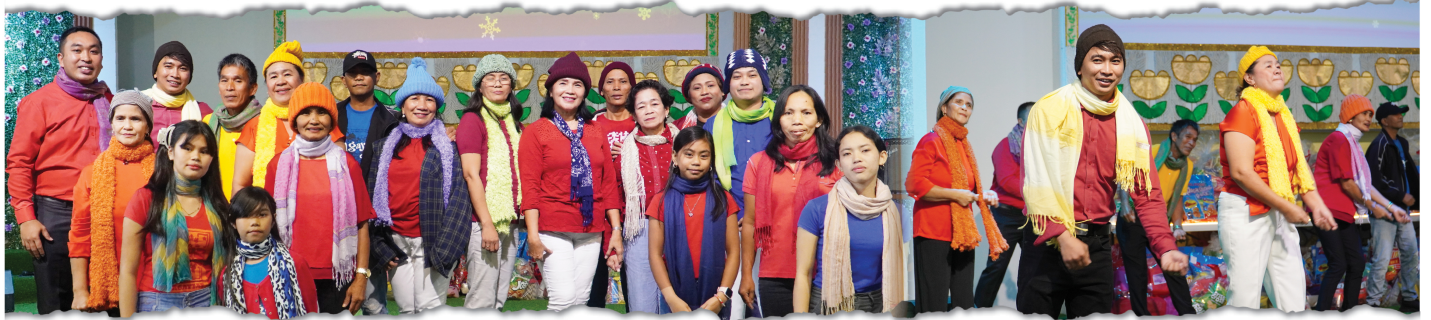
Suot at dala ang kani-kanilang makukulay na props at costume, isang pamilya silang umawit at sumayaw bilang kanilang pasasalamat kay Hesus.