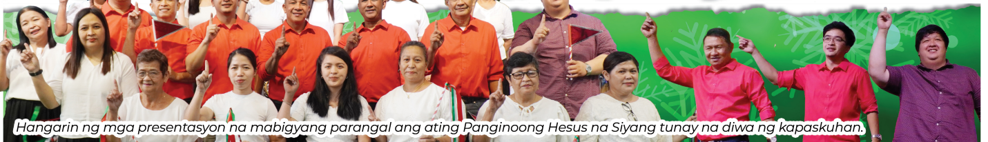
Hangarin ng mga presentasyon na mabigyang parangal ang ating Panginoong Hesus na Siyang tunay na diwa ng kapaskuhan.