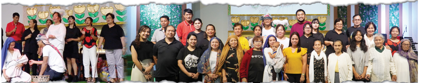
Kanilang binigyang buhay ang kuwento ng pagsasakatuparan ng pangakong si Hesus ang Siyang daan, buhay at katotohanan.