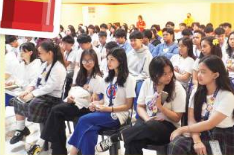
The students actively participate and listen to the speaker, taking down notes as he discusses the basics and importance of fire safety.