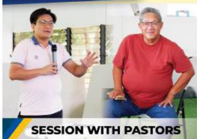
SESSION WITH PASTORS