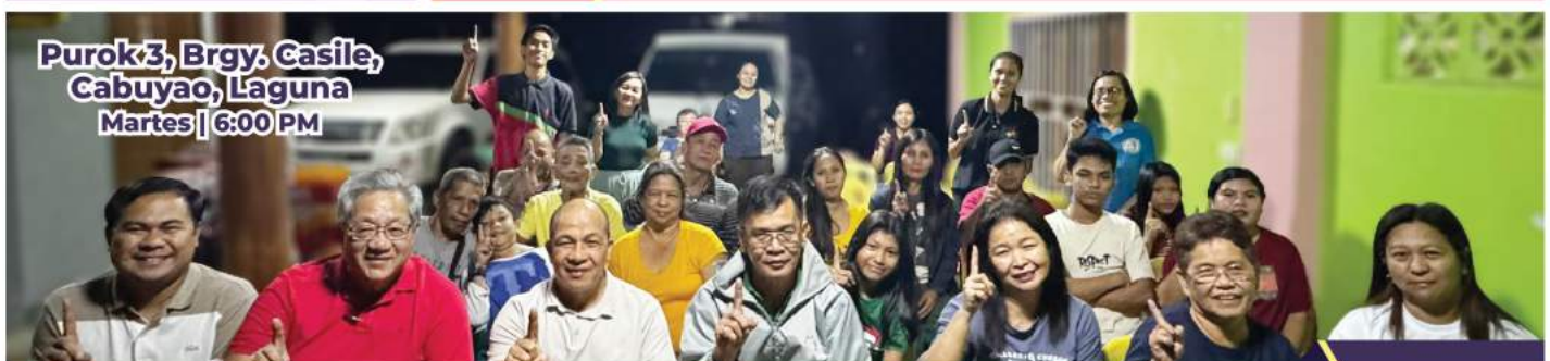
Purok 3, Brgy. Casile, Cabuyao, Laguna Martes | 6:00 PM