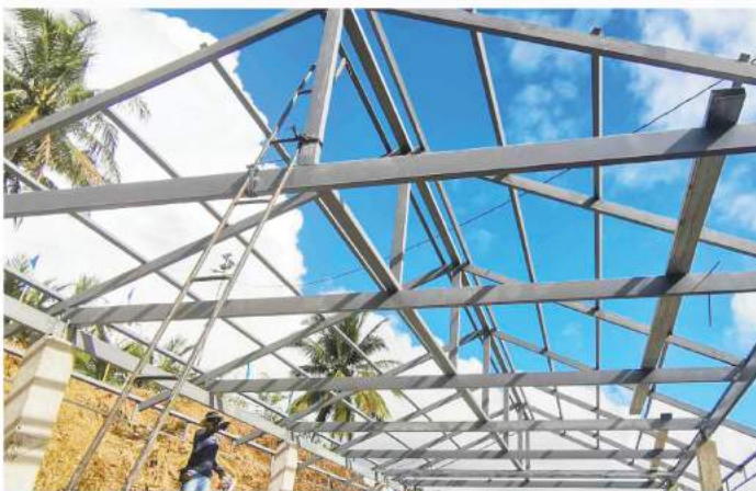
Nagkabit ng mga metal truss upang mapatibay ang estruktura ng bubong nito.