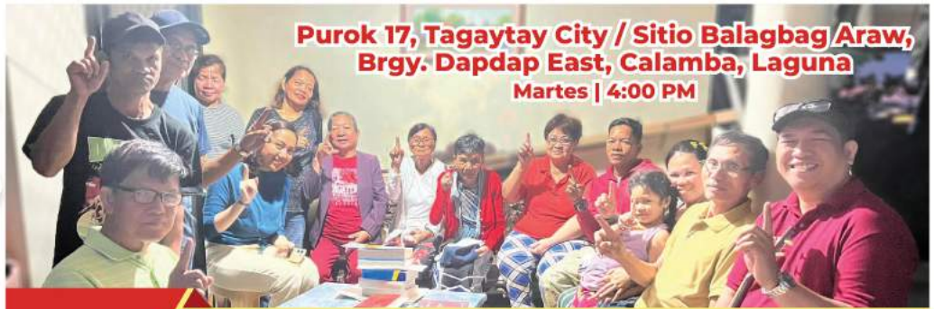
Purok 17, Tagaytay City / Sitio Balagbag Araw, Brgy. Dapdap East, Calamba, Laguna Martes | 4:00 PM

Sa ngayon ay siyam (9) na HBC na ang naitayo sa iba't ibang lugar. Tunay na ang Diyos ang nagbubuklod sa Kaniyang mga tupa. Purihin ang Diyos sapagkat ang tinig Niya ay narinig ng Kaniyang mga anak!