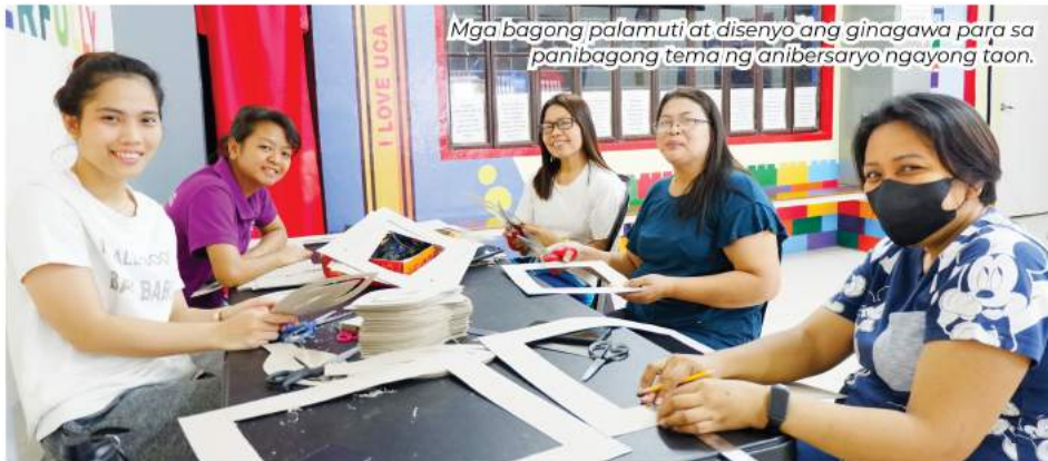
Mga bagong palamuti at disenyo ang ginagawa para sa panibagong tema ng anibersaryo ngayong taon.

Tuloy-tuloy ang paggawa at mga paghahanda kaya naman tayo rin ay makiisa na anyayahan ang ating mga mahal sa buhay na makadalo sa espesyal na araw na ito. Pagkakataon din nila ito na makarinig ng Salita ng Diyos at maranasan Siya sa kanilang mga buhay. Purihin ang Panginoon sa Kaniyang kadakilaan!