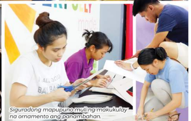
Siguradong mapupuno muling makukulay na ornamento ang panambahan.