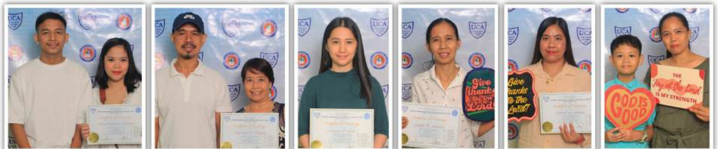
To celebrate and commemorate their special day, graduates snap photos at the photobooth area together with their loved ones.