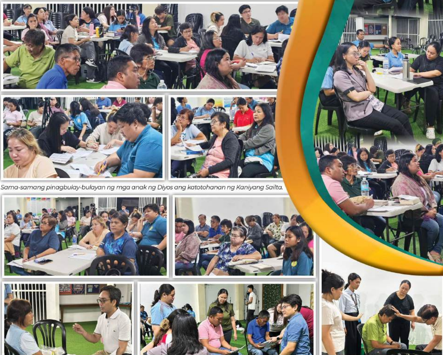
Sama-samang pinagbulay-bulayan ng mga anak ng Diyos ang katotohanan ng Kaniyang Salita.

Tiyak na babaunin ng mga nagsipagdalo ang kanilang bagong natutunan upang maisabuhay sa kanilang paglakad sa Panginoon.