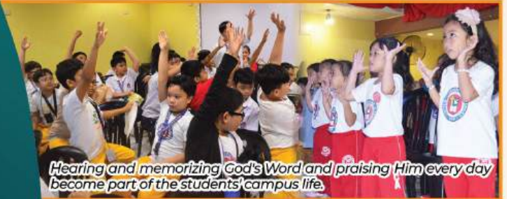
Hearing and memorizing God's Word and praising Him every day become part of the students' campus life.