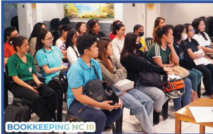
BOOKKEEPING NC III

Everyone in the orientation attentively listen to the instructions that will help them as they progress in their training as future bookkeepers.