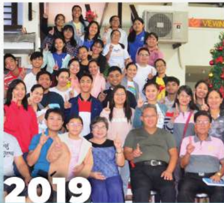
Sa nakalipas na maraming taon ng pagsunod sa Diyos nang mayroong katapatan, naging mas tapat ang Panginoong tumawag sa bawat isa. Kabi-kabilang mga gawain ang inihahanda para sa mga manggagawa at miyembro ng UCF upang kanilang mas makita at maunawaan ang tawag ng Diyos sa kanilang mga buhay at tuwid na makalakad ayon sa Kaniyang dakilang kalooban.