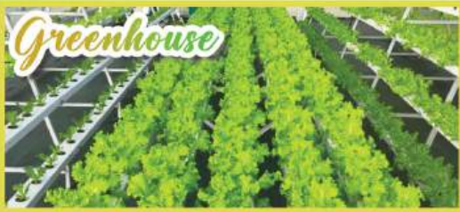
Muling inaabangan ang pag-ani sa mga bagong tanim na lettuce sa loob ng greenhouse.

Tunay na ang bawat karagdagang pasilidad ay para sa kapakinabangan at kalaguan ng ministeryo ng Panginoon.