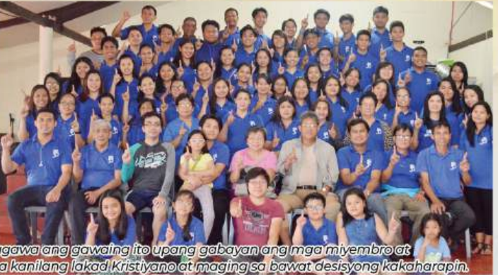
Taunang isinasagawa ang gawaing ito upang gabayan ang mga miyembro at manggagawa sa kanilang lakad Kristiyano at maging sa bawat desisyong kakaharapin.