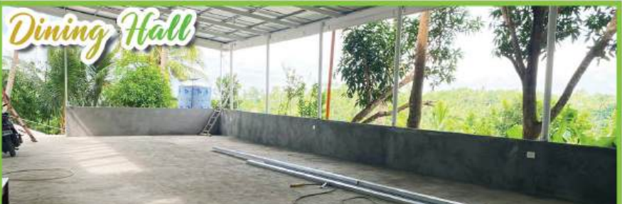
Isang kusina rin ang isinasagawa sa tabi ng dining hall bilang paghahanda sa malalapit na gawain kung saan ang masaganang salu-salo ay bahagi ng fellowship.