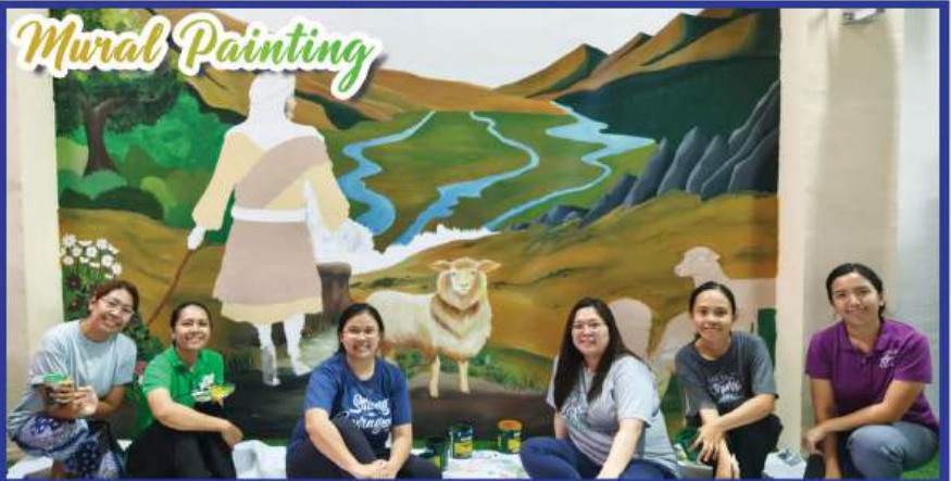
Ang mga manggagawa ay buong husay na pinipinturahan ang isa sa mga pader ng panambahan na repleksiyon ng katotohanan mula sa Bibliya.