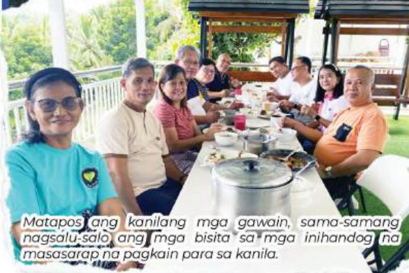
Matapos ang kanilang mga gawain, sama-samang nagsalu-salo ang mga bisita sa mga inihandog na masasarp na pagkain para sa kanila.