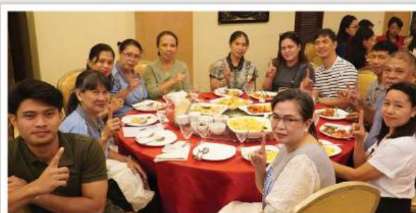
Iba't ibang masasarap na putahe ang inihanda sa mga nagsipagdala. Kasabay ng kasiyahan ay busog na nagdiwang ang pamilya ng UCF.