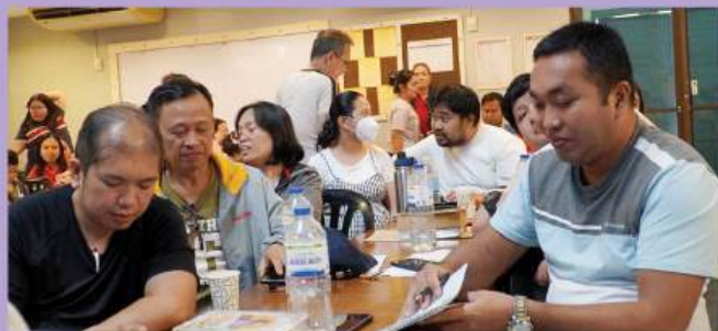
Nakinig ang lahat habang isinusulat ang mahalagang puntos ng mensahe tungkol sa kahulugan ng pagiging bagong nilalang.