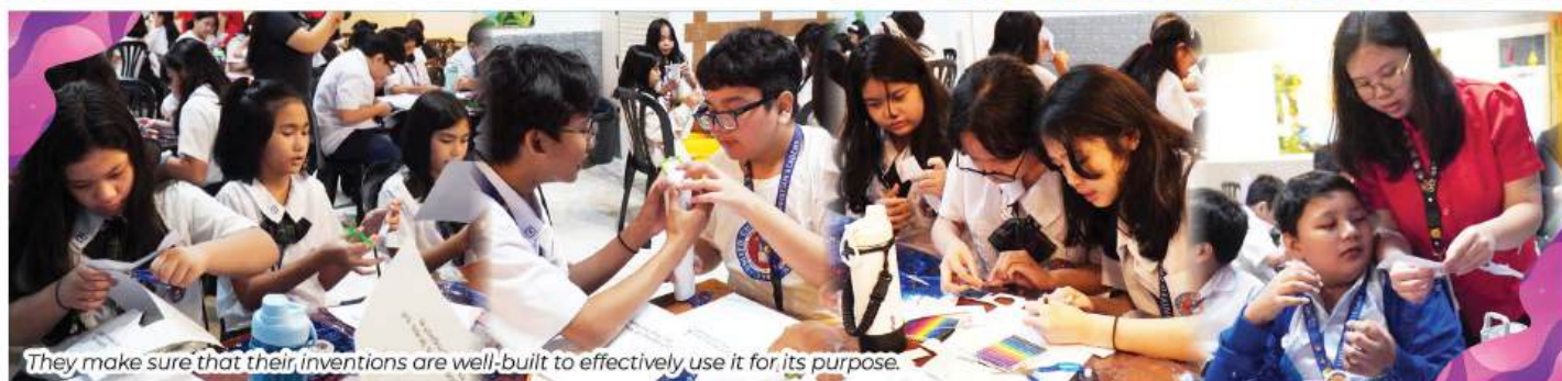
They make sure that their inventions are well-built to effectively use it for its purpose.

Students from Grade 7 to 12 were taught of the concept of projectile motion, quadratic equation, and space travel. These scientific fun-facts were applied on the invention that they made during the workshop.