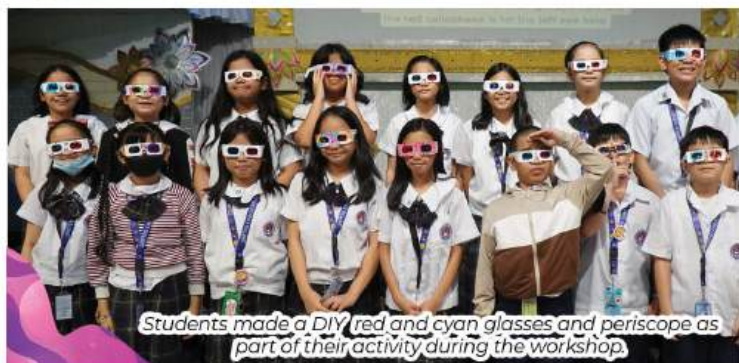
Students made a DIY red and cyan glasses and periscope as part of their activity during the workshop.

Pupils from Grade 4 to 6 explored the world of telescopes and microscopes. From its history and current use in today's world, students were fascinated of these world-class inventions and how they really help even the ordinary people wanting to use these technologies. DIY periscope and 3D glasses were also taught by merely using paper cardboards as their base materials.