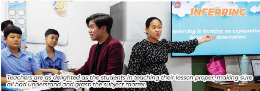
Teachers are as delighted as the students in teaching their lesson proper, making sure all had understand and grasp the subject matter.

Praise God for another school year that He has given for the students to learn and to come to know our Lord Jesus Christ!