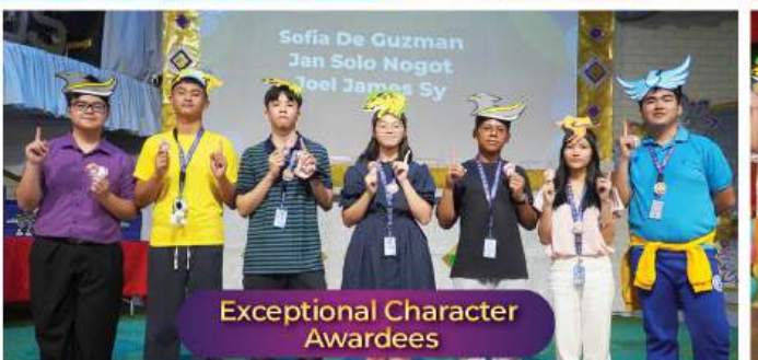
Exceptional Character Awardees