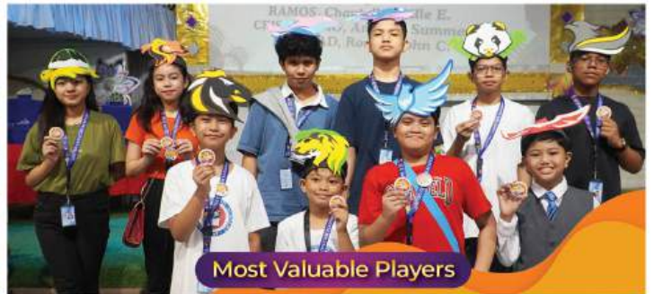
Most Valuable Players