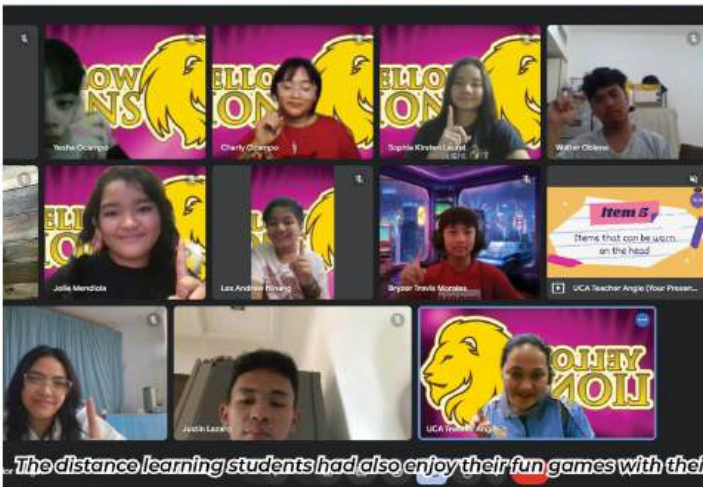
The distance learning students had also enjoy their fun games with their groupmates and with their team leaders.