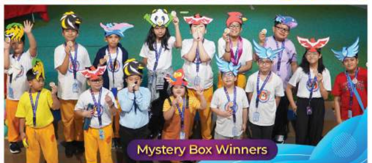
Mystery Box Winners