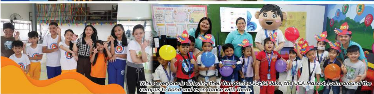
While everyone is enjoying their fun games, Joyful Jake, the UCA Mascot, roam around the campus to bond and even dance with them.