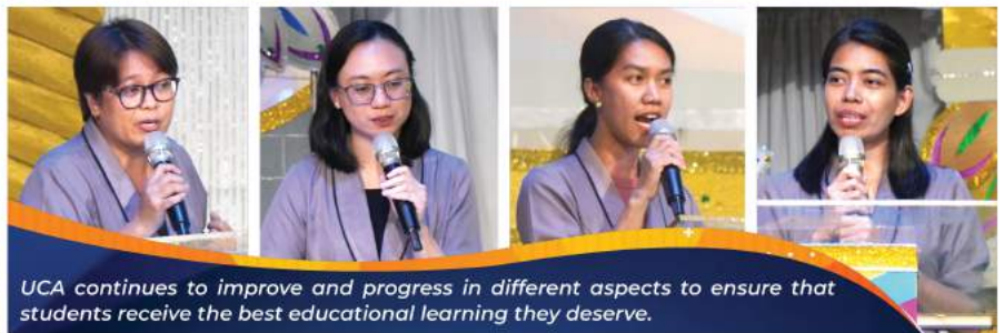
UCA continues to improve and progress in different aspects to ensure that students receive the best educational learning they deserve.