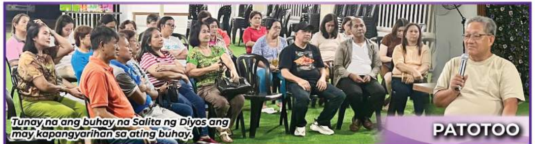
Tunay na ang buhay na Salita ng Diyos ang may kapangyarihan sa ating buhay.

Bakas sa ngiti ng kapatiran, ang kagalakang nagmumula sa Diyos.