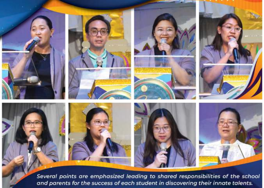
Several points are emphasized leading to shared responsibilities of the school and parents for the success of each student in discovering their innate talents.

The faculty and staff discussed important points that parents must be aware of the whole school year. Beyond the knowledge, grades, and awards, UCA is far more concerned with the student's well-being, confidence, life skills, and most importantly, their fear and love for God. UCA prepares students for the real-world scenarios they may encounter in the future. Praise the Lord for this educational ministry!