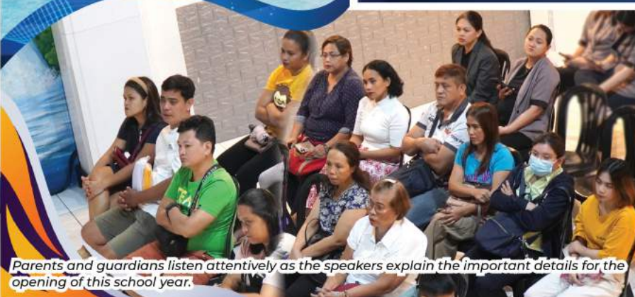
Parents and guardians listen attentively as the speakers explain the important details for the opening of this school year.