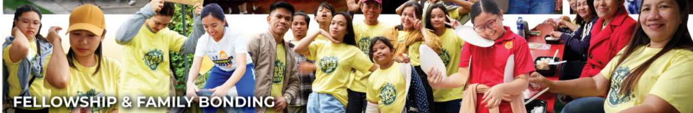
FELLOWSHIP & FAMILY BONDING

Samu't saring mga masasayang aktibidad ang naghihintay para sa bawat isang sasama sa makabuluhang programang ito.