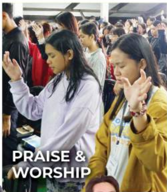
PRAISE & WORSHIP