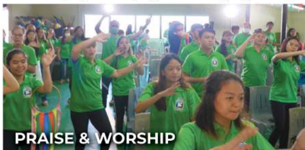
PRAISE & WORSHIP

Samu't saring mga masasayang aktibidad ang naghihintay para sa bawat isang sasama sa makabuluhang programang ito.