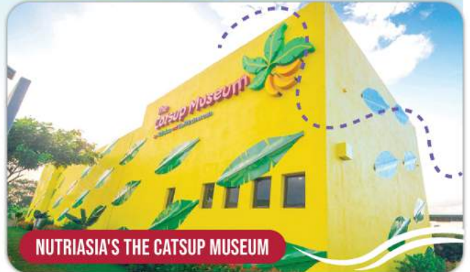
NUTRIASIA'S THE CATSUP MUSEUM