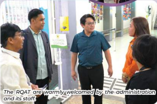
The RQAT are warmly welcomed by the administration and its staff.

For the institution's learning continuity, UCA College of Asia (UCACOA) opened its doors for Commission on Higher Education (CHED) inspection on its last leg of application for its four-year course BTVTED last March 20, Wednesday.