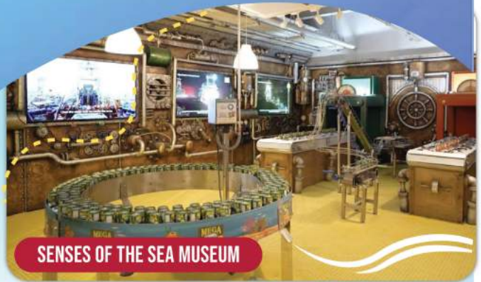
SENSES OF THE SEA MUSEUM

For payment and other details, you may contact the UCA Office until April 3, 2024. What are you waiting for? Register now!