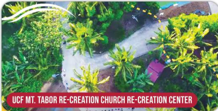
UCF MT. TABOR RE-CREATION CHURCH RE-CREATION CENTER