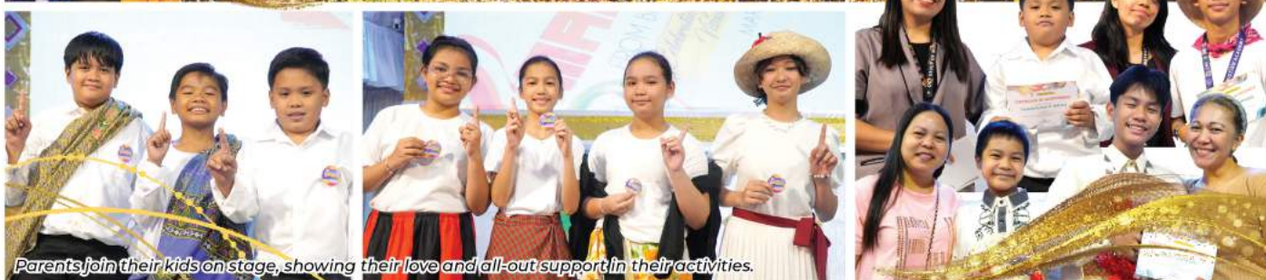
Parents join their kids onstage, showing their love and all-out support in their activities.