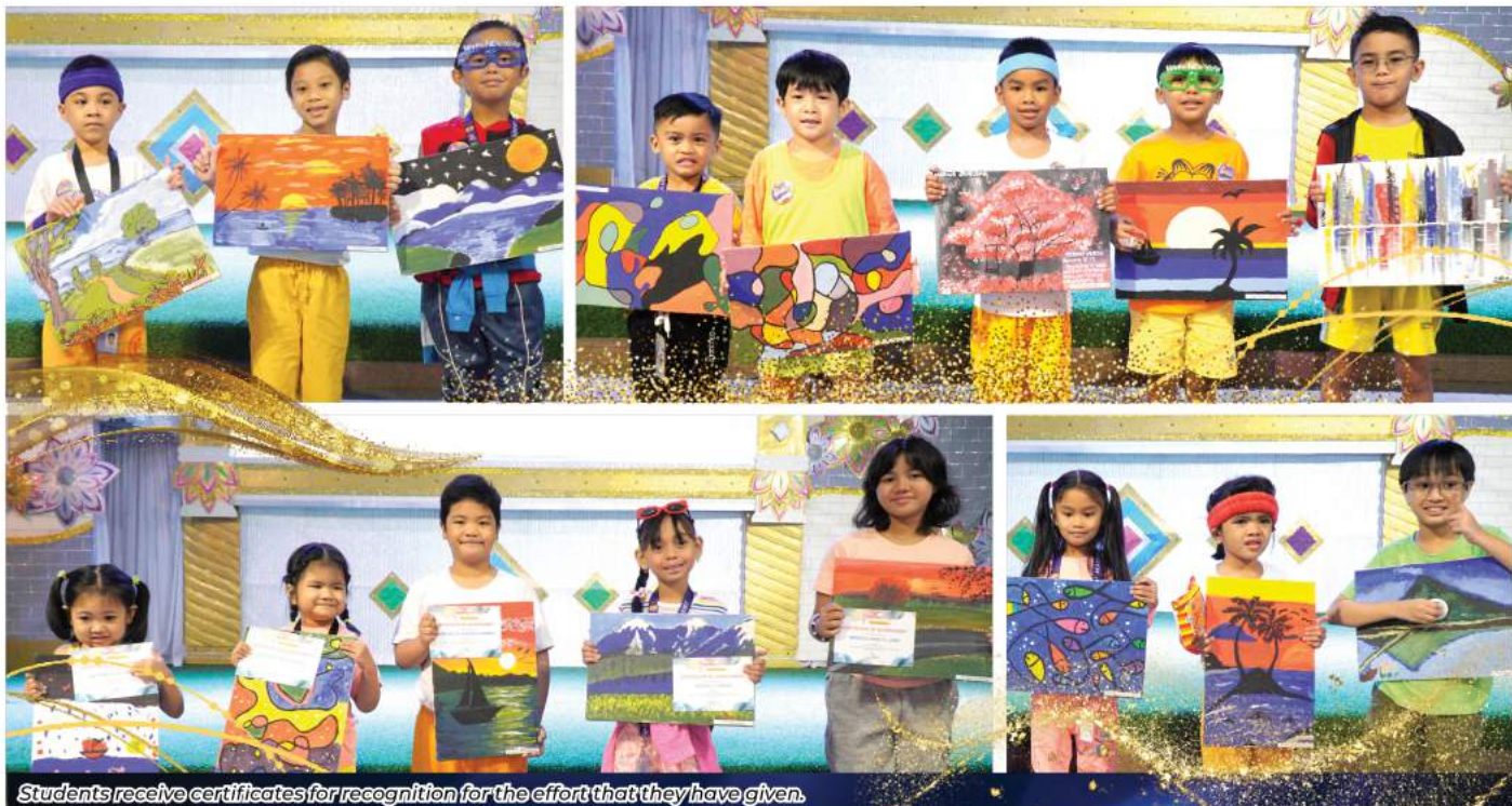
Students receive certificates for recognition for the effort that they have given.