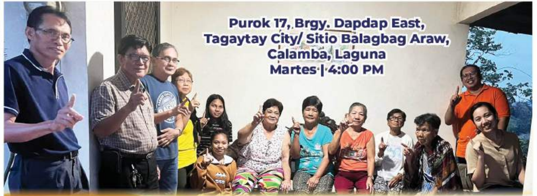
Purok 17, Brgy. Dapdap East, Tagaytay City/ Sitio Balagbag Araw, Calamba, Laguna Martes | 4:00 PM

Bilang mga nakakilala sa Panginoon, ating ipahayag ang Mabuting Balita ng kaligtasang kay Kristo lamang nagmumula. Sama-sama tayong maging asin at ilaw ng sanlibutan, mga buhay na patotoo ng pag-ibig ng Diyos.