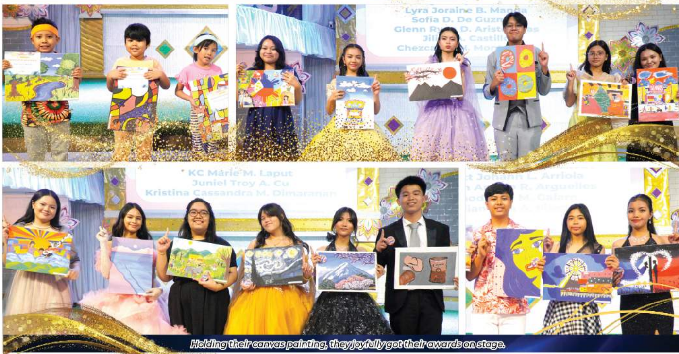
Holding their canvas painting, they joyfully got their awards on stage.