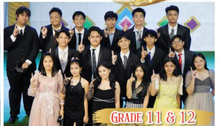
GRADE 11 & 12