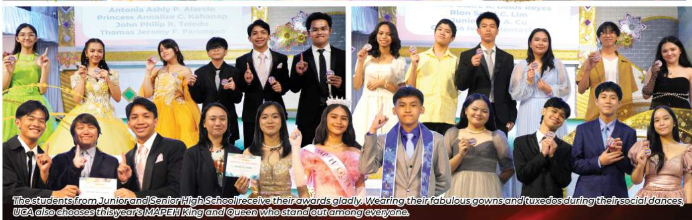
The students from Junior and Senior High School receive their awards gladly. Wearing their fabulous gowns and tuxedos during their social dances, UCA also chooses this year's MAPEH King and Queen who stand out among everyone.