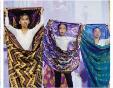
Students jive and dance along joyful music, showcasing various dance cultures and featuring aerobic exercises that made the parents and other guests delighted and proud.