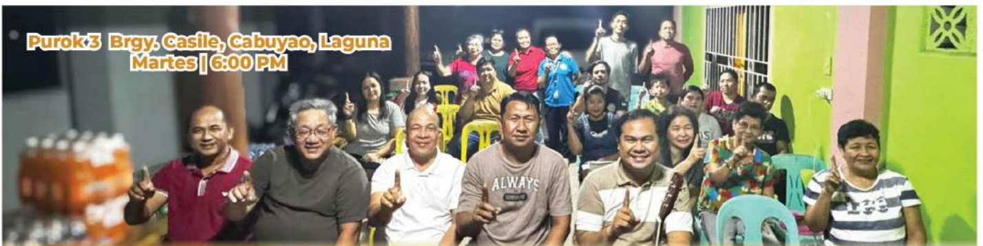
Purok 3 Brgy. Casile, Cabuyao, Laguna Martes | 6:00 PM