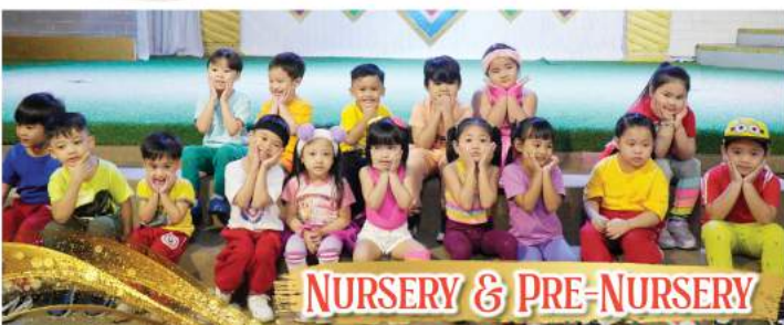
NURSERY & PRE-NURSERY