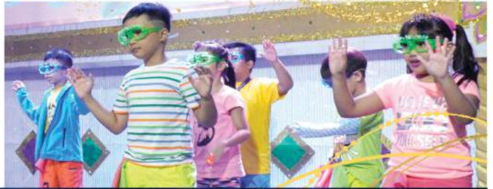
Unique and amazing presentations of the pupils were displayed and watched in MAPEH Day.