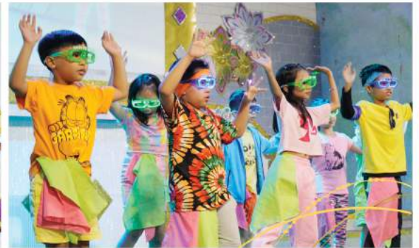
Clad with vibrant costumes and stunning dresses and suits, students perform alongside their classmates once again on stage.