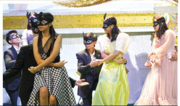
High school students enjoyed performing on stage as they dance smoothly with their classmates.