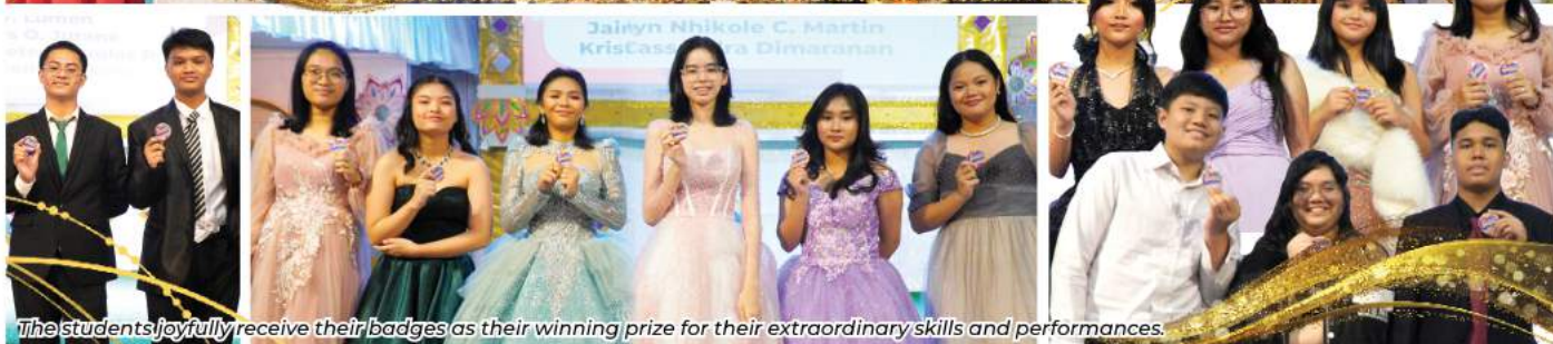
The students joyfully receive their badges as their winning prize for their extraordinary skills and performances.