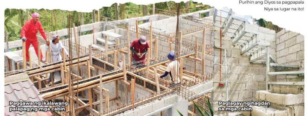
Paggawa ng ikalawang palapag ng mga cabin

Purihin ang Diyos sa pagpapala Niya sa lugar na ito!