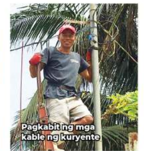
Pagkabiting mga kable ng kuryente

30 Now if God so clothes the grass of the field, which today is, and tomorrow is thrown into the oven, will He not much more clothe you, O you of little faith?