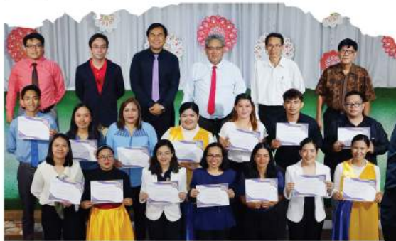
The UCFTS students are all smiles as they receive their awards. Even the congregation witnesses and congratulates them for this endeavor.

This training prepares them for the greater calling of God. To learn His Word and to serve the living God are truly a privilege. Praise God for the growing ministry of UCFTS!