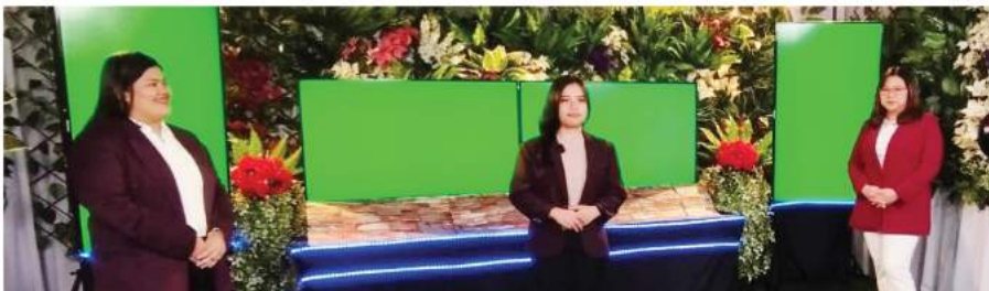
Ilan sa mga miyembro ng panambahan ang nag-uulat ng mga mahahalagang ginawa ng Diyos sa nagdaang taon.