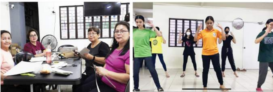
Tulong-tulong ang mga boluntaryo mula sa iba't ibang fellowship group para sa paggawa ng mga dekorasyon. Maliban dito ay nag-eensayo rin ng kanilang presentasyon ang youth fellowship.