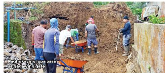
Paghukay ng lupa para sa gagawing gate