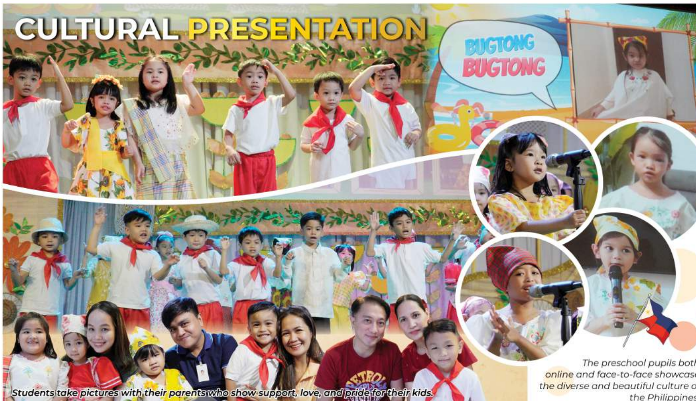
Students take pictures with their parents who show support, love, and pride for their kids.