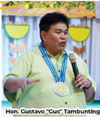
Hon. Gustavo "Gus" Tambunting