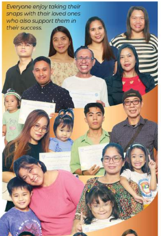
Everyone enjoy taking their snaps with their loved ones who also support them in their success.