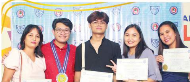
During the graduation, the scholars meet new found friends from their online class which made them all excited.