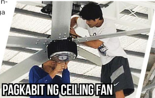
PAGKABIT NG CEILING FAN

Upang presko ang hangin sa panambahan, nagkabit ng metal ceiling fan sa panambahan na magbibigay ng mapreskong simoy ng hangin.