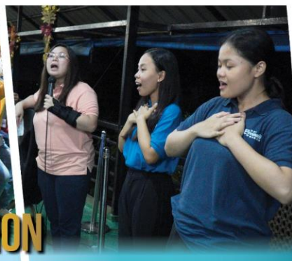
Patuloy ang paghahanda ng mga fellowship group para sa kanilang mga special number. Tampok dito ang ilang mga manggagawa at dumadalo ng Bible Study sa Mt. Tabor.