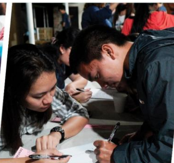
Noong Martes naman ay ipinagpatuloy ang pamimigay ng mga tiket para sa mga nais na makatanggap ng libreng serbisyong medikal, dental at optikal sa outreach mission sa darating na Sabado.