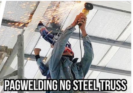
PAGWELDING NG STEEL TRUSS

Upang presko ang hangin sa panambahan, nagkabit ng metal ceiling fan sa panambahan na magbibigay ng mapreskong simoy ng hangin.