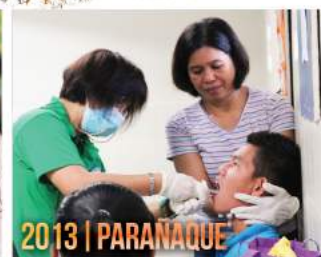
2013 | PARANAQUE