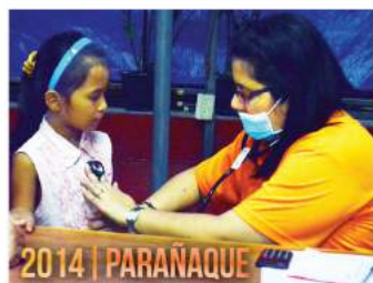
2014 | PARANAQUE

Isa na namang pagbibigay luwalhati sa Panginoon ang gawaing ito. Tayo ay magsama-sama sa isang kagila-gilalas na pagkilos muli ng Diyos sa panambahan ng UCF.