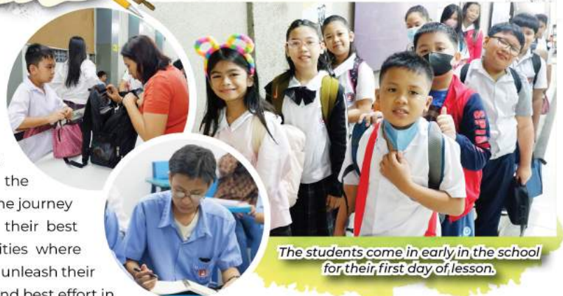
The students come in early in the school for their first day of lesson.

Through the years, UCA develops students engraved with culture of excellence so that they may become good citizens of the society. With God's greater favor to the school, it will continue to rise above in academics and bring students in the knowledge of the Lord.