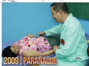
2009 | PARANAQUE