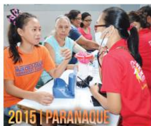
2015 | PARANAQUE