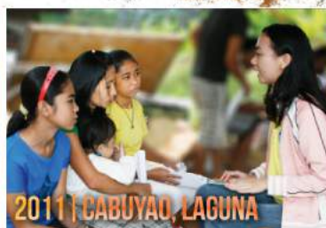
2011 | CABUYAO, LAGUNA