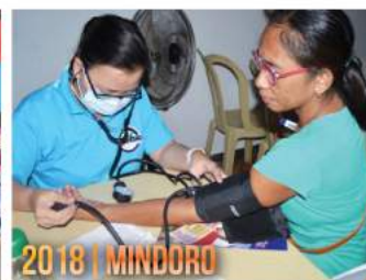
2018 | MINDORO

Sa mahigit tatlumput-anim na taon ay nakapagsagawa na ng 21 Medical-Dental-Optical Outreach Mission ang panambahan ng UCF sa iba't ibang lugar sa Pilipinas, upang maabot ang libo-libong benepisyaryo sa pamamagitan ng mga manggagawang ginamit ng Diyos upang maihayag ang pag-ibig ni Kristo sa bawat isa.