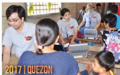
2017 | QUEZON