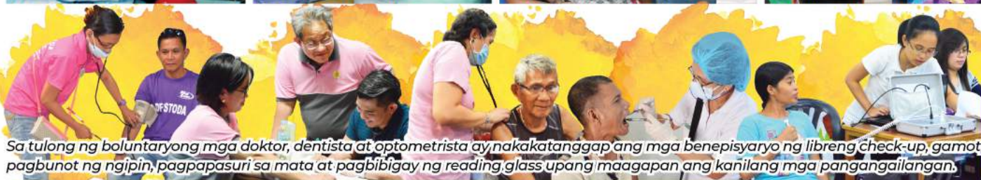
Sa tulong ng boluntaryong mga doktor, dentista at optometrista ay nakakatanggap ang mga benepisyaryo ng libreng check-up, gamot, pagbunot ng ngipin, pagpapasuri sa mata at pagbibigay ng reading glass upang maagapan ang kanilang mga pangangailangan.

Isa sa mga iniatas ng Panginoon sa panambahan ng UCF ay ang pagpapalaganap ng Mabuting Balita kung kaya ang UCF ay nagsasagawa ng mga programang aabot sa ating mga kababayan sa iba't ibang dako ng Pilipinas.