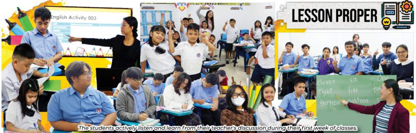
The students actively listen and learn from their teacher's discussion during their first week of classes.