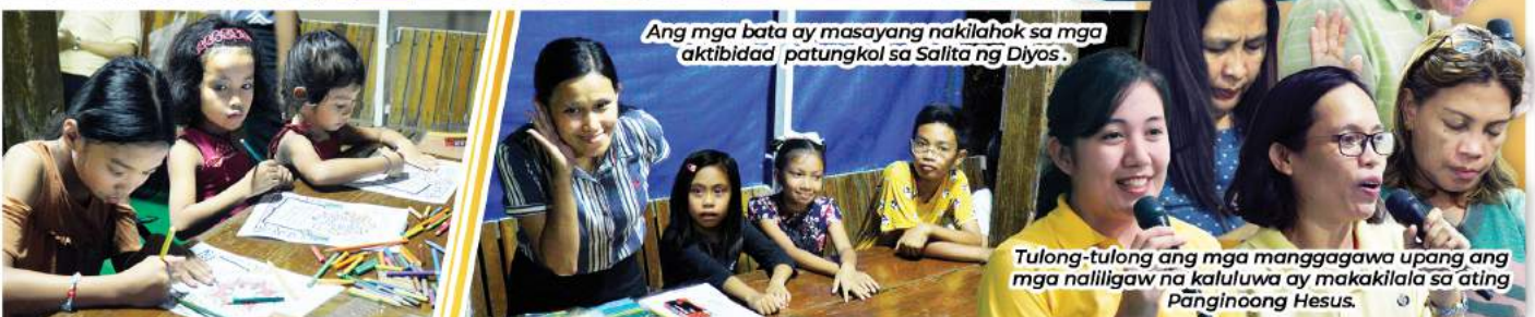
Ang mga bata ay masayang nakilahok sa mga aktibidad patungkol sa Salita ng Diyos.