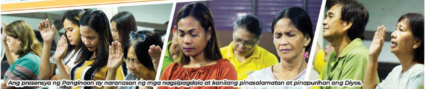
Ang presensya ng Panginoon ay naranasan ng mga nagsipagdalo at kanilang pinasalamatan at pinapurihan ang Diyos.