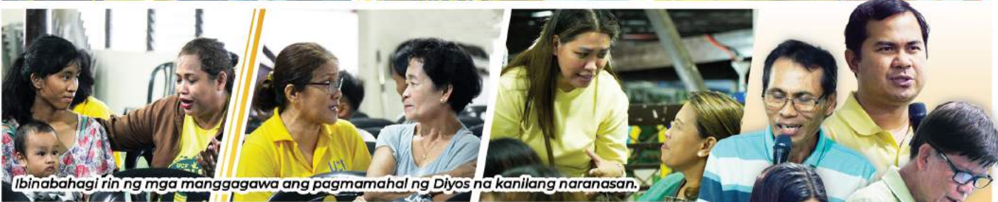
Ibinabahagi rin ng mga manggagawa ang pagmamahal ng Diyos na kanilang naranasan.