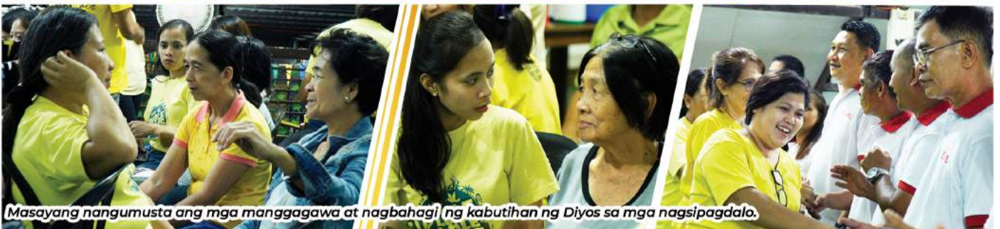
Masayang nangumusta ang mga manggagawa at nagbahagi ng kabutihan ng Diyos sa mga nagsipagdalo.