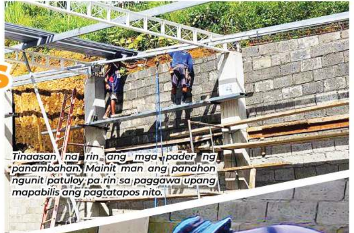
Tinaasan na rin ang mga pader ng panambahan. Mainit man ang panahon ngunit patuloy pa rin sa paggawa upang mapabilis ang pagtatapos nito.