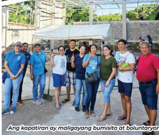
Ang kapatiran ay maligayang bumisita at boluntaryong tumulong sa konstruksiyon ng panambahan.