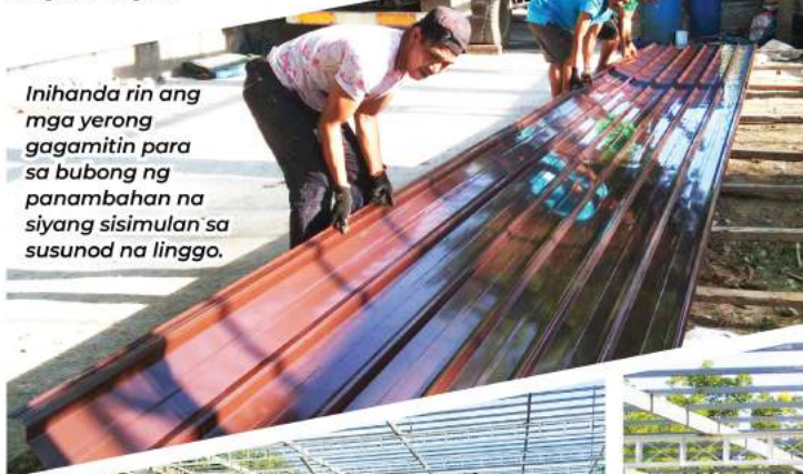
Inihanda rin ang mga yerong gagamitin para sa bubong ng panambahan na siyang sisimulan sa susunod na linggo.

Tunay na walang imposible sa Panginoon dahil sa Kaniyang pagsama at sa mga anak Niyang inilalagak ang pananampalataya sa Kaniya. Patunay ito na ang Diyos ay buhay dahil sa mga lingkod Niyang tinawag ng Diyos at patuloy na lumalakad sa Kaniyang kalooban. Mataas na papuri sa Iyo, o Diyos!