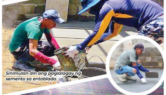
Sinimulan din ang paglalagay ng semento sa entablado.