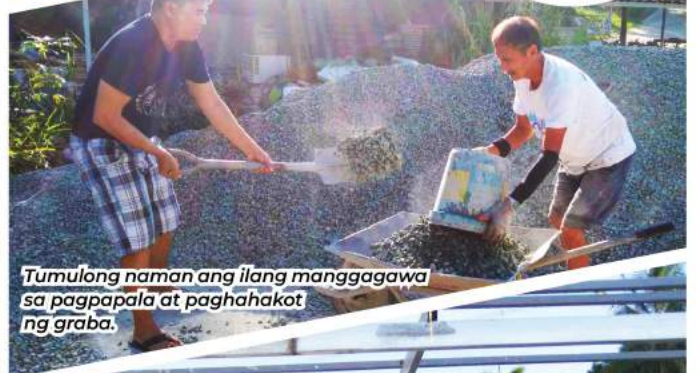
Tumulong naman ang ilang manggagawa sa pagpapala at paghahakot ng graba.