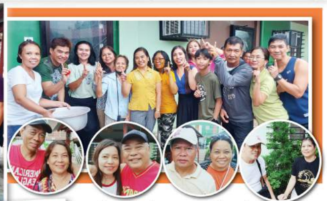
Kita sa kanilang mga ngiti ang kaluguran na makasama nila ang isa't isa sa gawaing ito. Talagang kinaaliwan ng lahat ang makapagtampisaw sa dagat at pool sa kabila ng malamig at maulan na panahon.