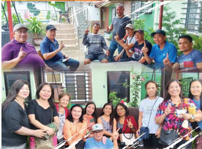
Masayang nagtipon-tipon ang Adult Fellowship Group upang sariwain ang magagandang ginawa ng Diyos sa kanilang mga buhay.

Kapag ang Diyos ang nasa sentro ng inyong pagsasama-sama, tiyak na punong-puno ito ng kasiyahan, pagmamahalan at pagmamalasakit. Purihin ang Panginoon sa matagumpay na pagtitipon na ito na lalong nagbuklod sa Kaniyang mga anak!