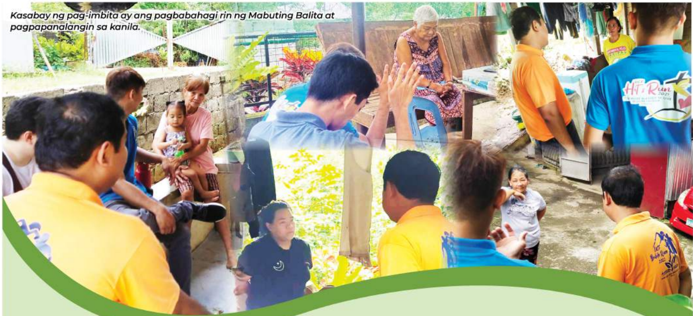
Kasabay ng pag-imbita ay ang pagbabahagi rin ng Mabuting Balita at pagpapalangin sa kanila.