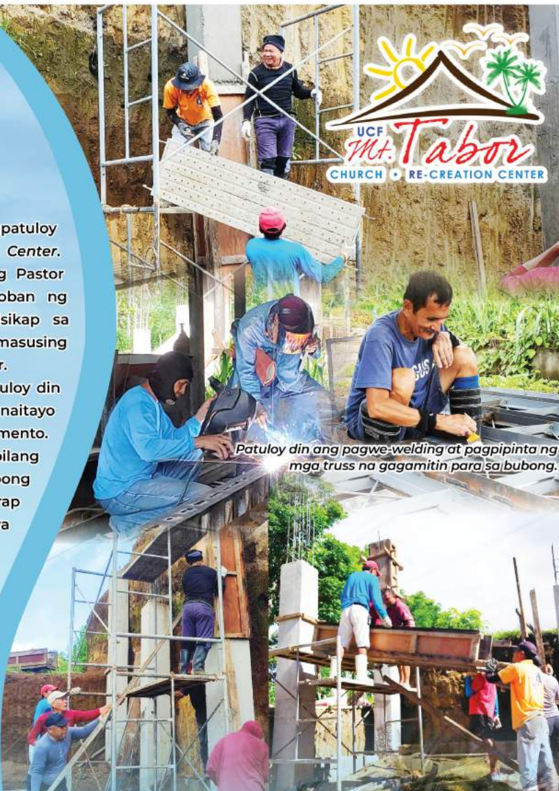
Patuloy din ang pagwe-welding at pagpipinta ng mga truss na gagamitin para sa bubong.