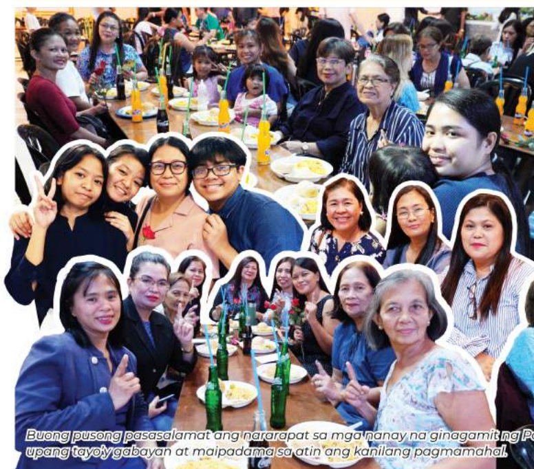
Buong pusong pasasalamat ang nararapat sa mga nanay na ginagamit ng Panginoon upang tayoygabayan at maipadama sa atin ang kanilang pagmamahal.