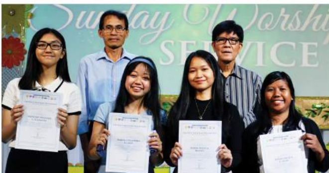
Buong galak na tinanggap ng bawat anak ng Diyos ang kanilang sertipiko ng bawtismo sa tubig. Kasama rin ang kapatiran at mga pastor sa mga nakisaya sa espesyal na araw na ito.

L ibo-libong anghel sa langit, ang masayang-masaya dahil sa isang makasalanang nagsisi," sabi sa Lucas 15:10. Luwalhati sa Diyos Ama para sa mga anak Niyang tumugon sa Kaniyang tawag ng kaligtasan at malugod na tinanggap ang magandang regalo na nagmumula kay Hesu Kristo.