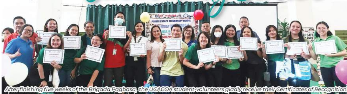
After finishing five weeks of the Brigada Pagbasa, the UCACOA student-volunteers gladly receive their Certificates of Recognition.

B uilding a strong professional network begins by joining local industry-related organizations or activities. UCA College of Asia (UCACOA), as the access to one's future, engages its students in various programs, allowing them to apply their learnings in real-life situations which also serves as their practical training.