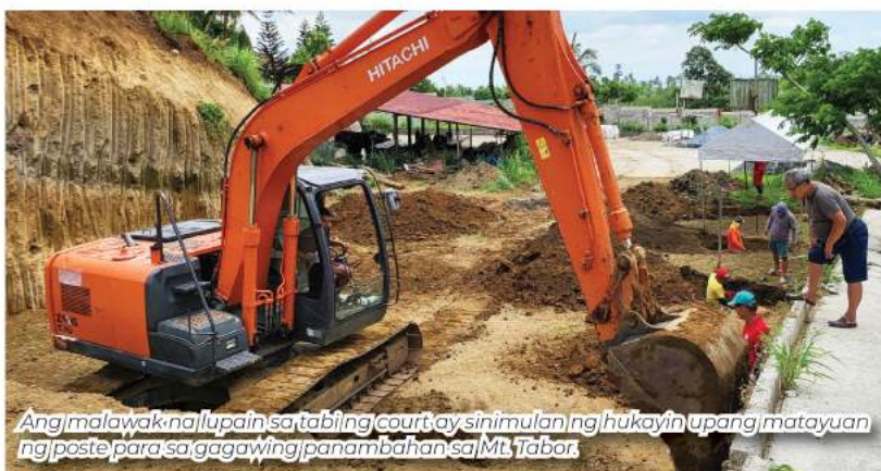
Ang malawak na lupain sa tabling court ay sinimulan ng hukayin upang matayuan ng poste para sa gagawing panambahan sa Mt. Tabor.