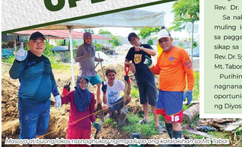
Masaya at buong lakas na naghukay ng mga lupa ang kalalakihan sa Mt. Tabor.

Purihin ang Diyos sa Kaniyang paggabay sa bawat isang nagnanais na magpagamit sa Kaniyang ministeryo na oportunidad upang ang buhay nila ay magamit sa kaluwalhatian ng Diyos!