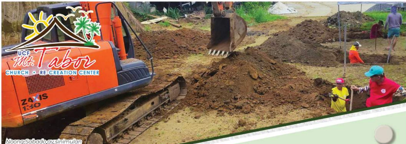
Noong Sabado ay sinimulan nang hukayin ang lupa na pagtatayuan ng panambahan sa Mt. Tabor.