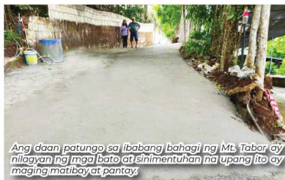
Ang daan patungo sa ibabang bahagi ng Mt. Tabor ay nilagyan ng mga bato at sinimentuhan na upang ito ay maging matibay at pantay.