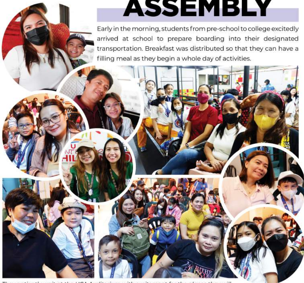
They patiently wait at the UCA Auditorium with excitement for the places they will explore in the educational trip.

Early in the morning, students from pre-school to college excitedly arrived at school to prepare boarding into their designated transportation. Breakfast was distributed so that they can have a filling meal as they begin a whole day of activities.