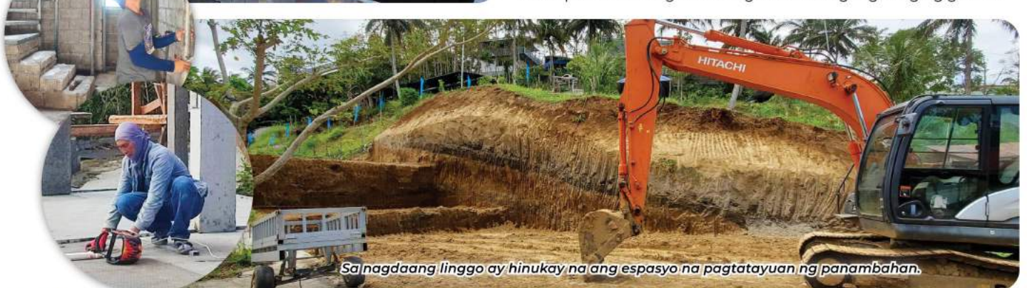
Sa nagdaang linggo ay hinukay na ang espasyo na pagtatayuan ng panambahan.

4 Praise Him with the timbrel and dance; Praise Him with stringed instruments and flutes! 5 Praise Him with loud cymbals; Praise Him with clashing cymbals! 6 Let everything that has breath praise the Lord. Praise the Lord!